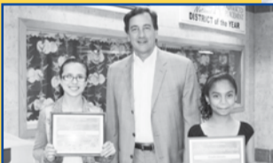
Earth Day Winner pg. 6