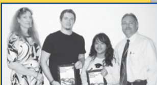
Safe Drivers pg. 7