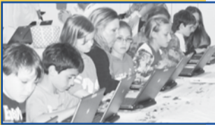
Laptops and Literacy pg. 5