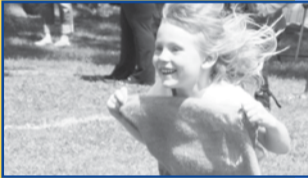
Field Day Fun pg. 4