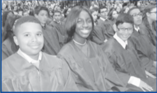
Moving on to High School pg. 3