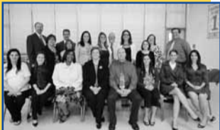
Retired & Tenured pg. 2