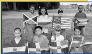
Fun Filled-Days pg. 7