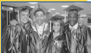
...Class of 2012! pg. 4-5