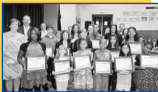
Artists on Display pg. 6