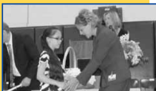
Celebrating Class Day pg. 3