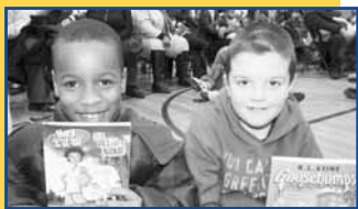
Nights of Literacy pg. 4