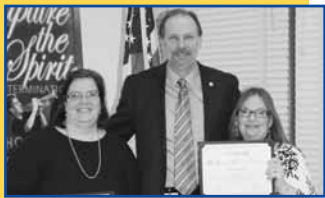
Board Members Honored pg. 2