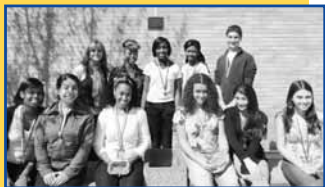
DECA Takes Gold pg. 3