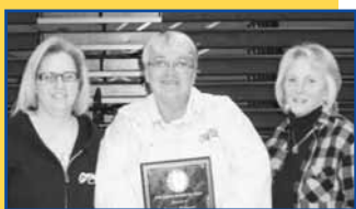
"Woman in Sports" pg. 8