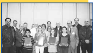
Knights Honor Students pg. 6