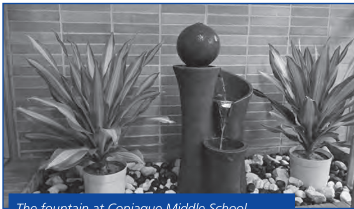
The fountain at Copiague Middle School.