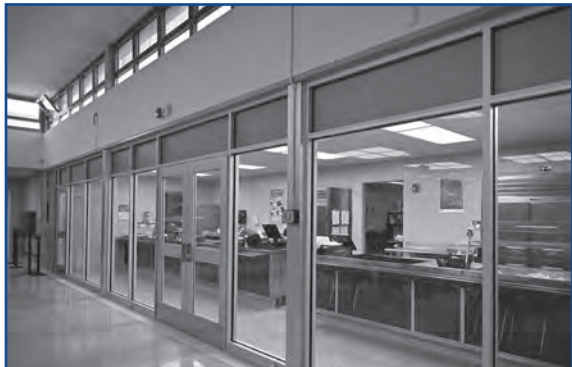
The cafeteria serving entrance at Walter G. O'Connell Copiague High School.