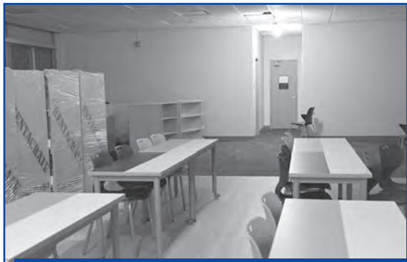
The renovations in the Copiague Middle School library are close to completion.