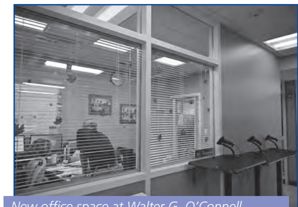
New office space at Walter G. O'Connell Copiague High School.