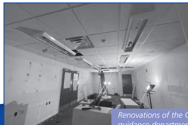
Renovations of the College and Career Room in the guidance department at Walter G. O'Connell Copiague High School.