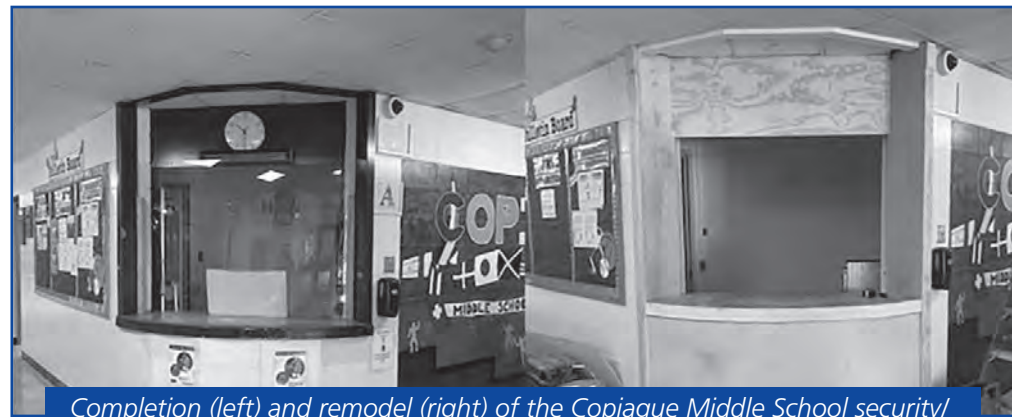
Completion (left) and remodel (right) of the Copiague Middle School security/greeter's entrance.