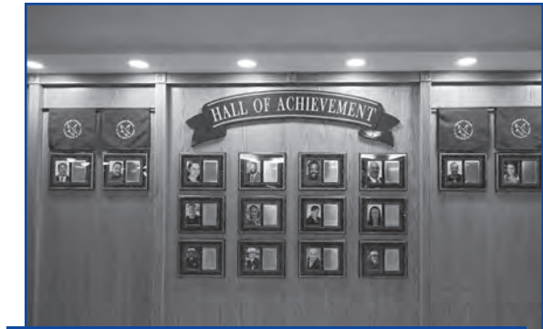
An additional Hall of Achievement wall was installed opposite the main entrance to the high school.