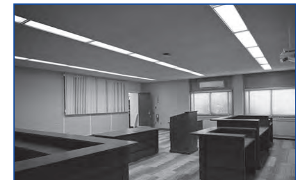
A Mock Trial Room was created by renovating an existing classroom space off the high school's library.