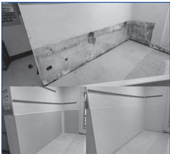
Replacement of trim and wall repair.