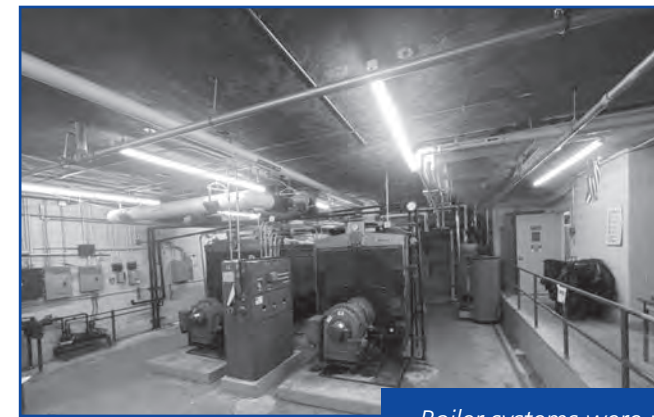
Boiler systems were upgraded in two buildings.