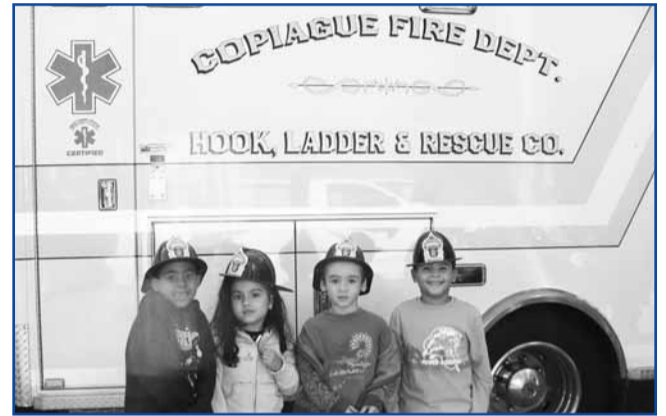
Deauville Gardens Elementary School Kindergarten students visited the Copiague firehouse and received a tour from several volunteer firefighters.

The firefighters also took the time to visit the individual schools to teach the students the importance of fire safety and prevention. The firefighters spoke to the students about the importance of being prepared and alert if caught in a fire. Students were instructed that if they see smoke, smell smoke, or hear the smoke alarm, they are to get outside immediately and that they should not stop and gather belongings during a fire, because belongings are replaceable. They also told the students to speak to their parents about setting up a place where they can meet if they are ever in a situation in which their house is on fire.