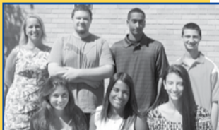
Advanced Scholars pg. 6