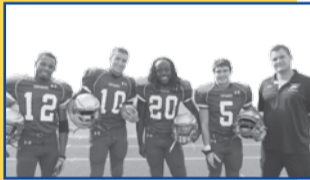
Homecoming 2013 pg. 4-5