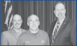
Honoring Staff Service pg. 2