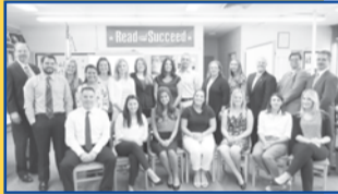
Welcome New Teachers pg. 3