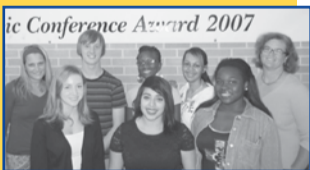
All-County Musicians pg. 7