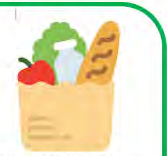
For more information please contact our CMS social workers.

In collaboration with the Collinsville Food Pantry, CMS is happy to offer families with the Tote Me Home program. Tote Me Home provides families with additional grocery assistance over the weekend. Students involved in the program are given a bag of groceries to take home on Fridays.