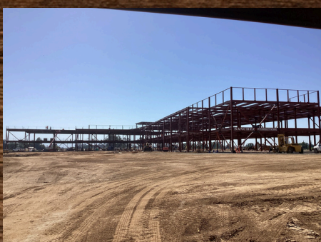
CONSTRUCTION OF SANCHEZ INTERMEDIATE SCHOOL ACADEMIC TOWER