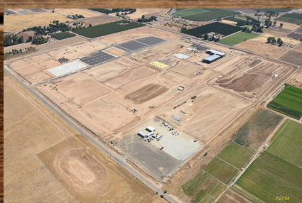
AERIAL IMAGE OF TBEC JULY, 2024

Would you be interested in participating in the inception of the Longhorns Foundation? We invite you to attend an informational meeting on Monday, September 9th, at 5:30 pm in the Hirayama Elementary School MPR.