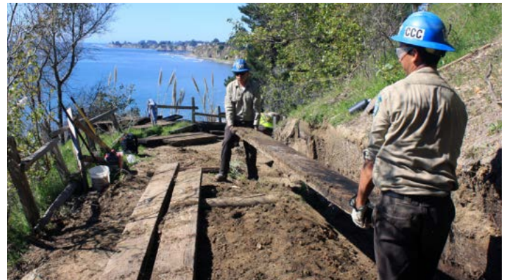
Corpsmembers improve public access to state parks and beaches with trail maintenance projects