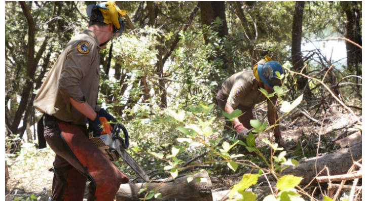
The CCC Forestry Corps reduces overgrown vegetation and dying trees, which can fuel large wildfires.