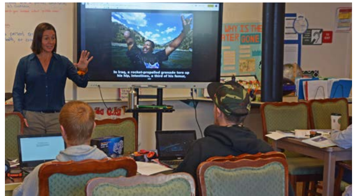
Corpsmembers can earn their high school diploma through courses taught onsite at CCC centers