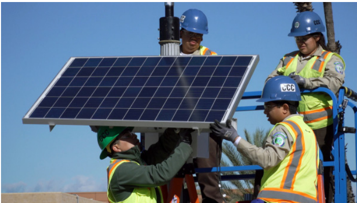
CCC Energy Corps reduces California's Greenhouse Gas emission with renewable and energy-efficient alternatives