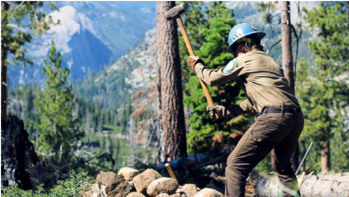
Corpsmembers build and maintain trails in remote wilderness areas as part of the Backcountry Trails Program