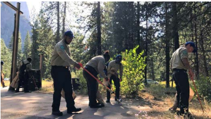
Corpsmembers earn scholarships by volunteering up to 48 hours annually