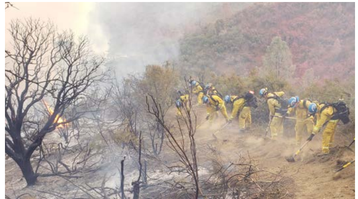
CCC wildland firefighters respond to fight fires and provide support at fire base camps