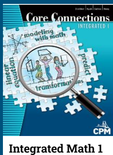
Integrated Math 1