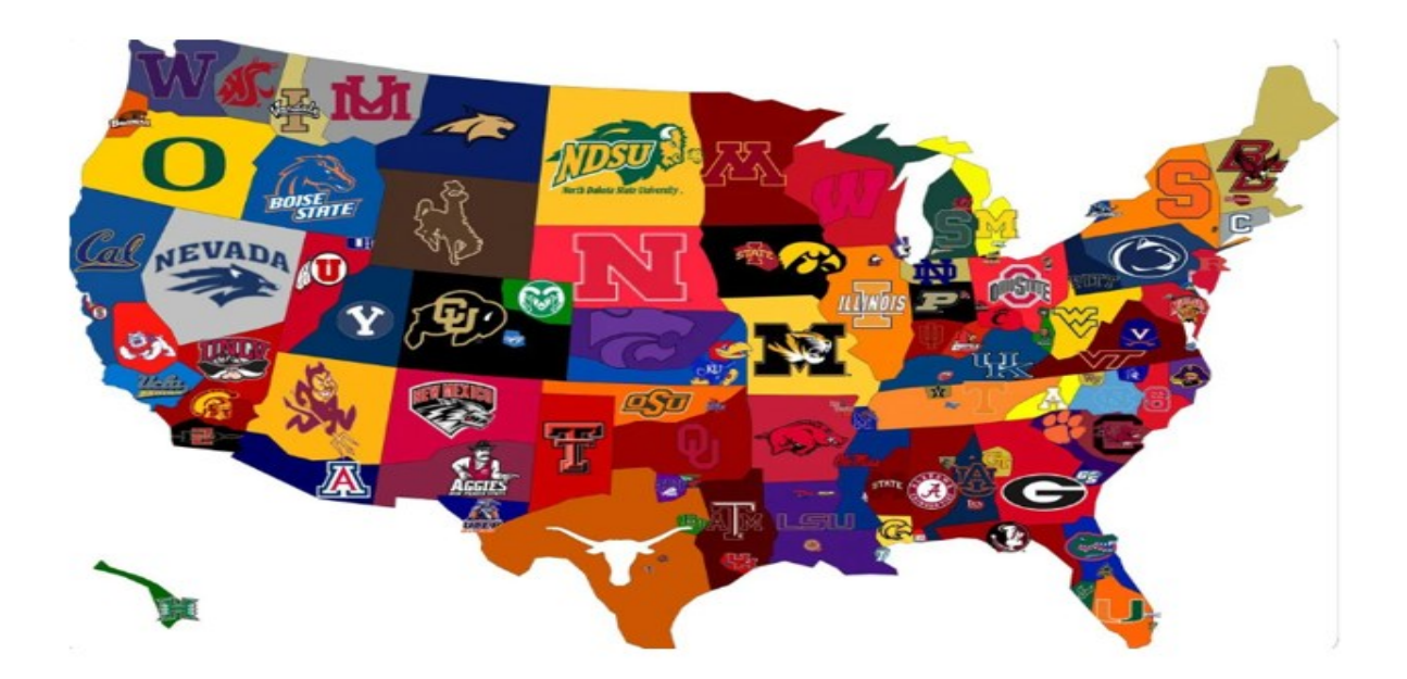
Wear your College Gear and Promote College Readiness for our Miners!!

1<sup>st</sup> Wednesday of every month is College Day!