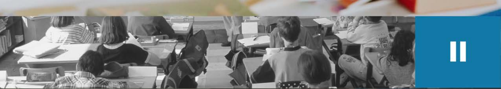
TABLE OF REFERENCES FOR PARENTS AND GUARDIANS