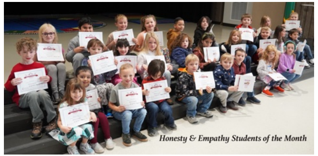
Honesty & Empathy Students of the Month