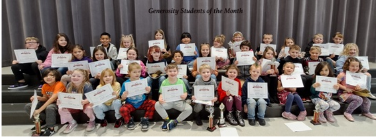
Generosity Students of the Month