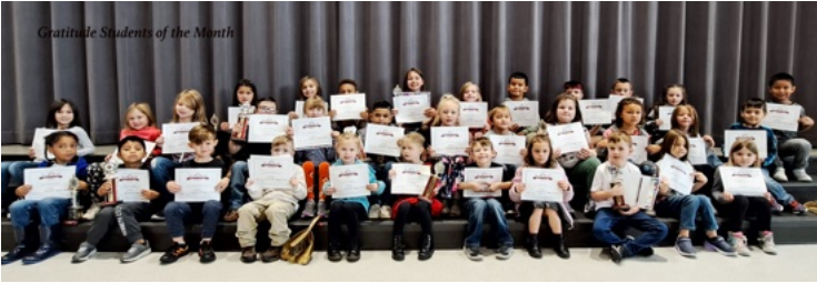
Gratitude Students of the Month