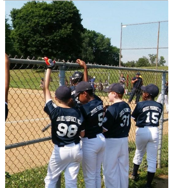
The Home of Canton Mitey Mite Baseball Since 1954

For More Info Contact the Stearn Center at 330 455-3921