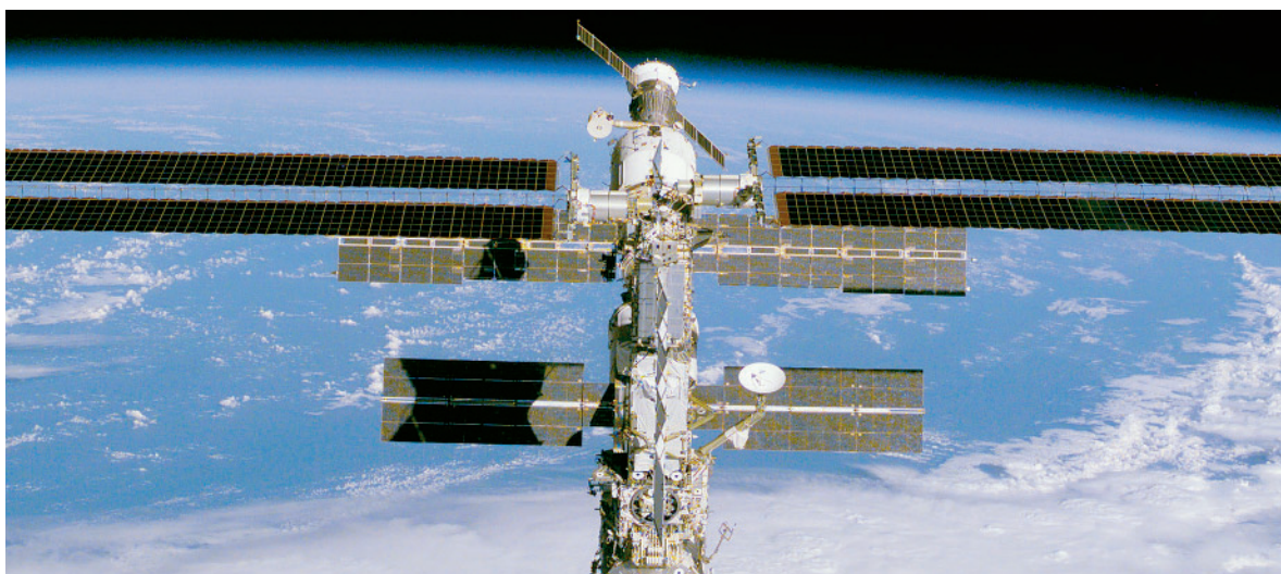
▲ This view of the ISS was taken from the space shuttle Endeavor .

of a football field and house a crew of six. Since October 2000, smaller crews have been working aboard the ISS. By early 2003, they had conducted more than 100 experiments. However, the suspension of the shuttle program after the crash of the shuttle Columbia in February 2003 put the future of the ISS in question.