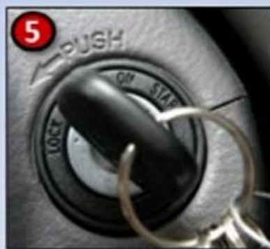
Turn ignition off