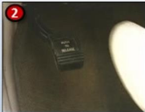
Set parking brake