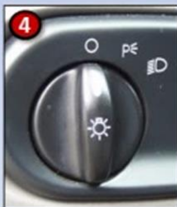
Turn off headlights/ accessories