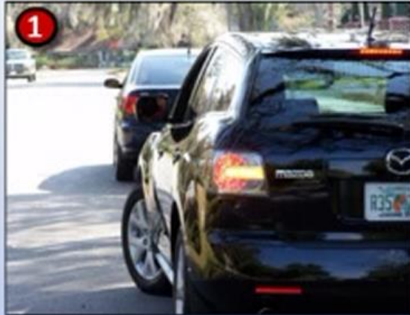
Signal and check traffic