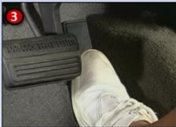
Release brake, accelerate gently