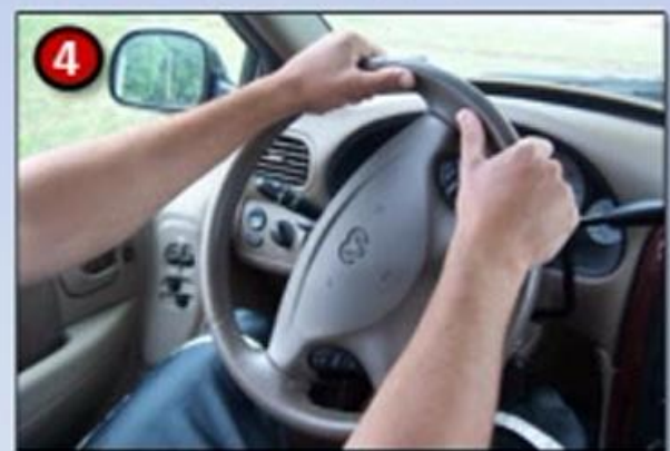
Steer into intended path