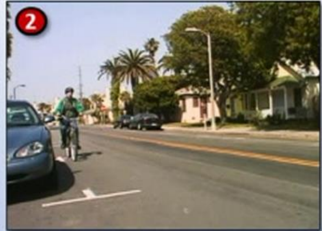
Identify safe gap in traffic