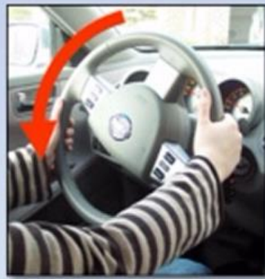
Push / pull