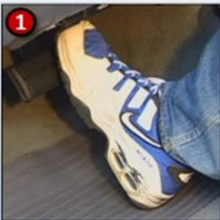
Foot on brake