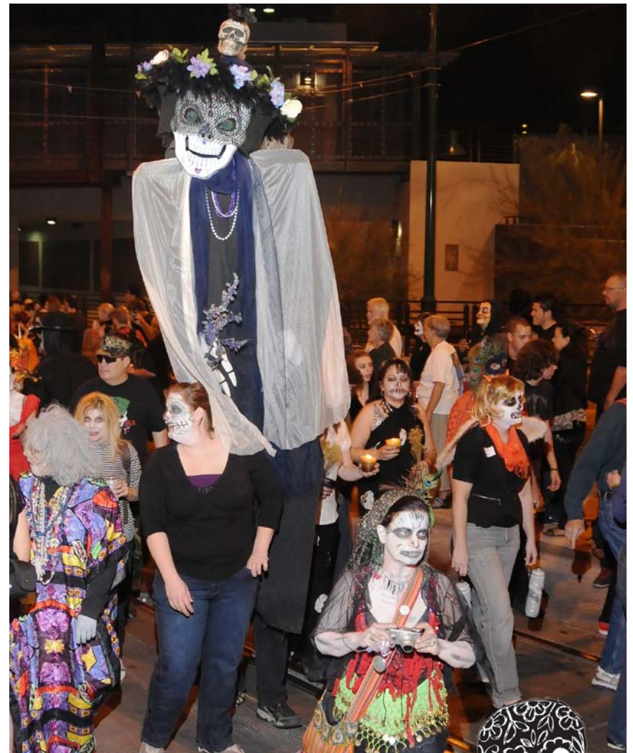
One of the many puppets in the Tucson, Arizona, parade stands above the crowd.