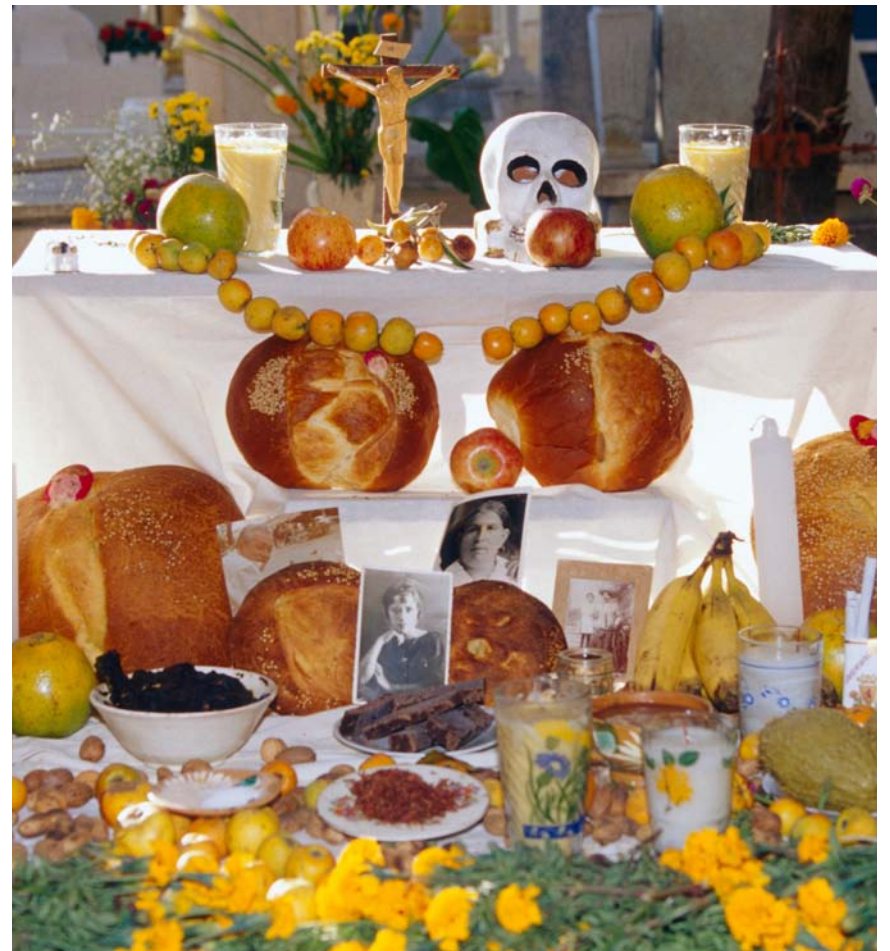
An altar decorated with special bread and other foods

The family lights candles around the altars. They also make special bread. They might even leave a favorite drink. Flowers, skeleton toys, and dolls also decorate the altars.