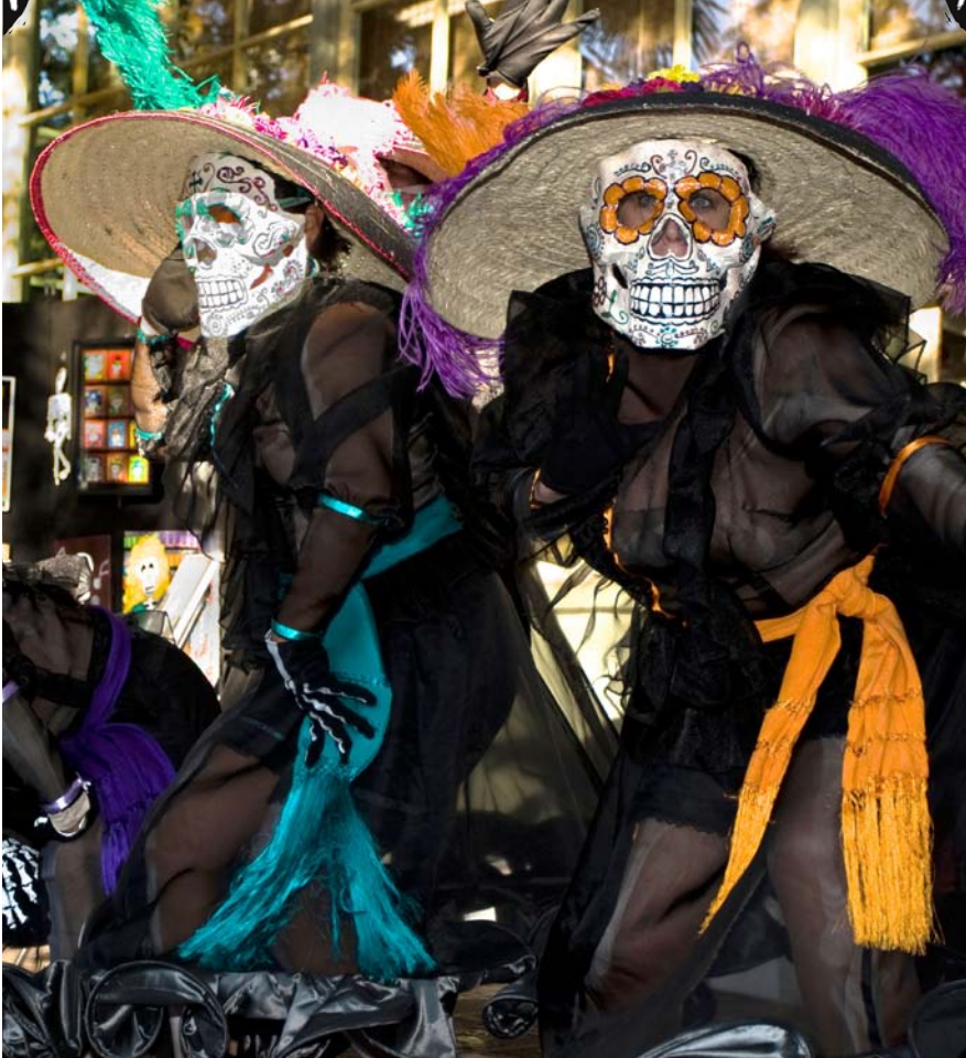
These dancers show off their painted skull masks at the Day of the Dead parade in San Antonio, Texas.

Before the parade, Lidia makes masks. Children and adults paint the masks and wear them in the parade.