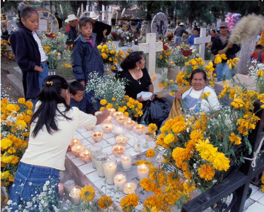
A family visits and decorates the grave of a loved one in Mexico.

Día de los Muertos might seem like Halloween. The two holidays are different, though. Halloween is often about scaring people. Día de los Muertos is a time of joy. People remember and celebrate loved ones who have died.