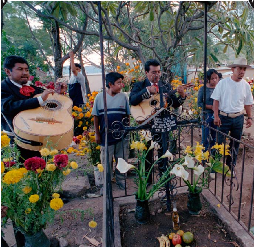
A band plays in a cemetery in Mexico.

They told stories about those who had died. Bands played special songs. Lidia and the other children danced and played all day. Día de los Muertos was always a happy day for Lidia.