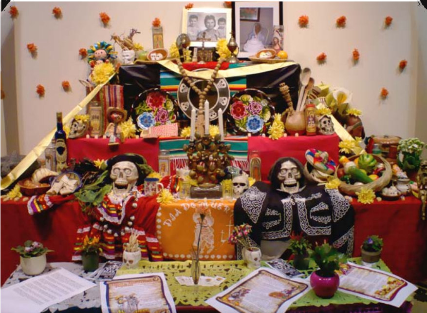
An altar decorated for a loved one in a family member's home

Día de los Muertos has many other traditions . Some people build altars in their homes. The altars are covered with cloth. The family puts up photos of the person who has died. They might add a favorite item or piece of clothing of the loved one.