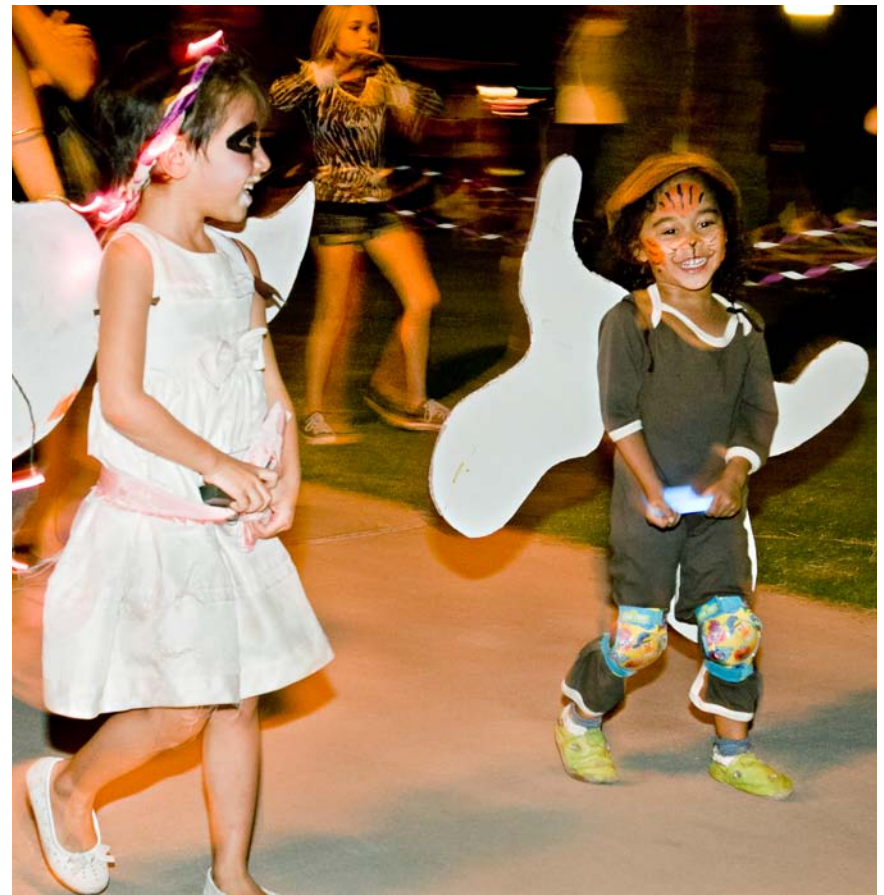
Children wear different costumes as they walk in their special parade in Tucson, Arizona.