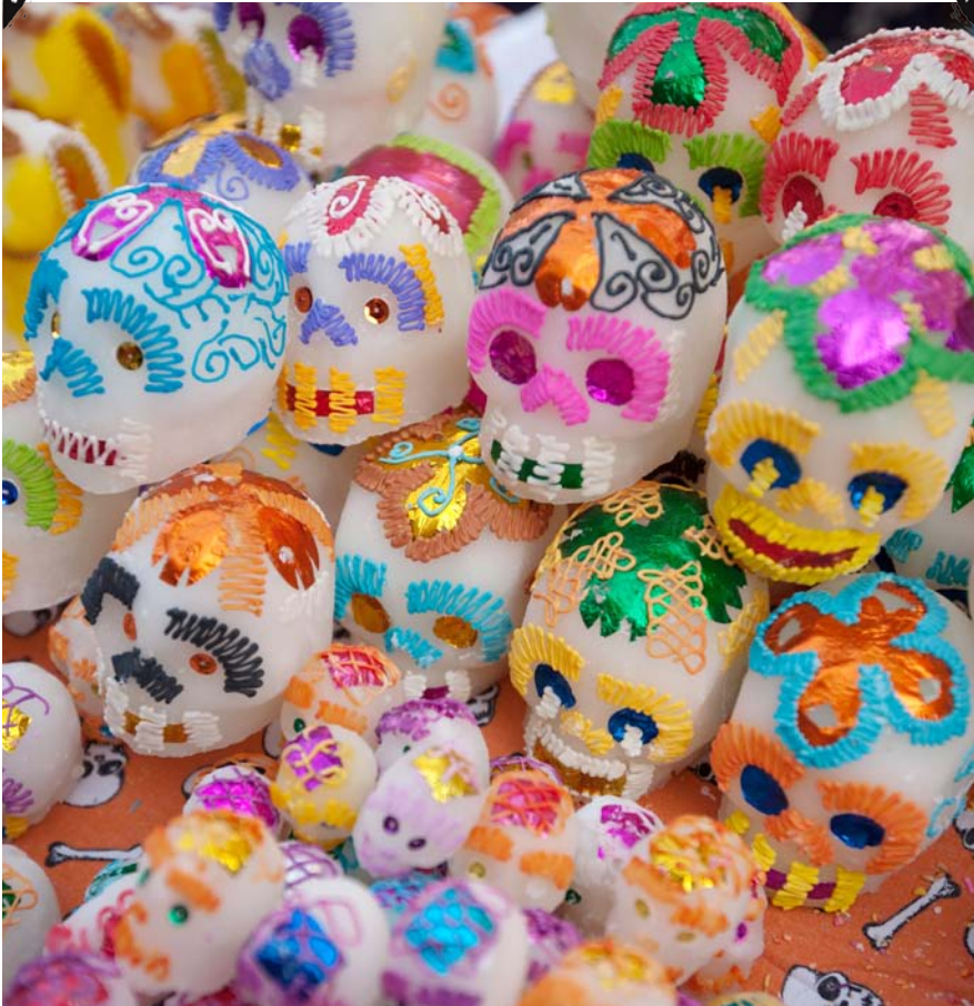
Handmade sugar skulls are displayed at a market in Mexico.

Some people make sugar skulls. People decorate the sugar skulls with colorful frosting. Children love eating the sweet skulls.