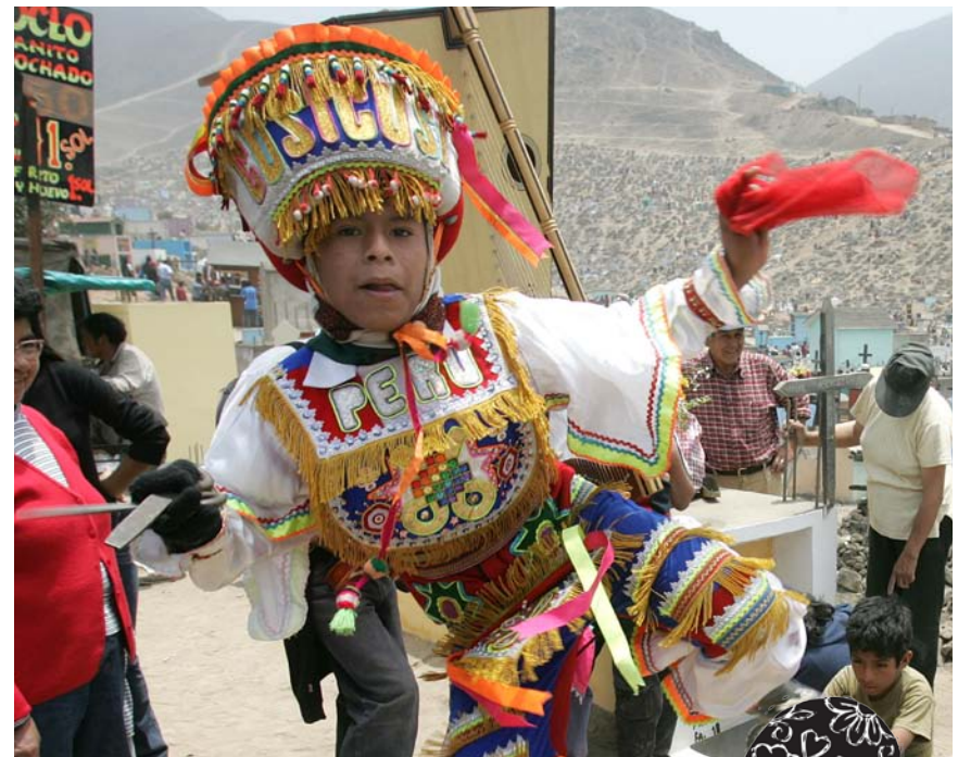
A boy performs a traditional "scissors dance" for Día de los Muertos in Lima, Peru.