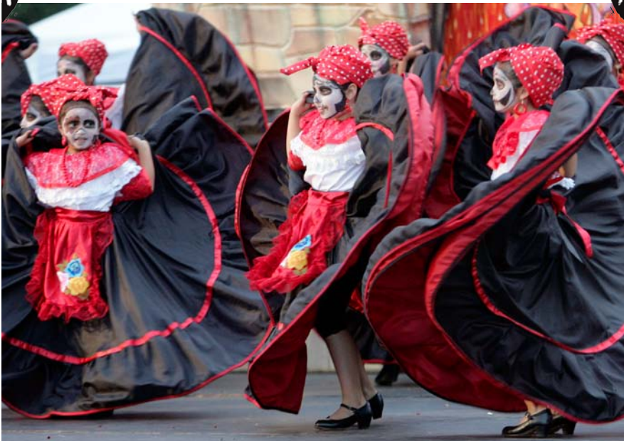
Children perform at a special Day of the Dead festival in Los Angeles, California.

Día de los Muertos helps people to feel better after losing someone they love. Marching in a parade or decorating altars can help them celebrate that special person. No other holiday is so full of life, costumes, masks, joy, memories, and love.