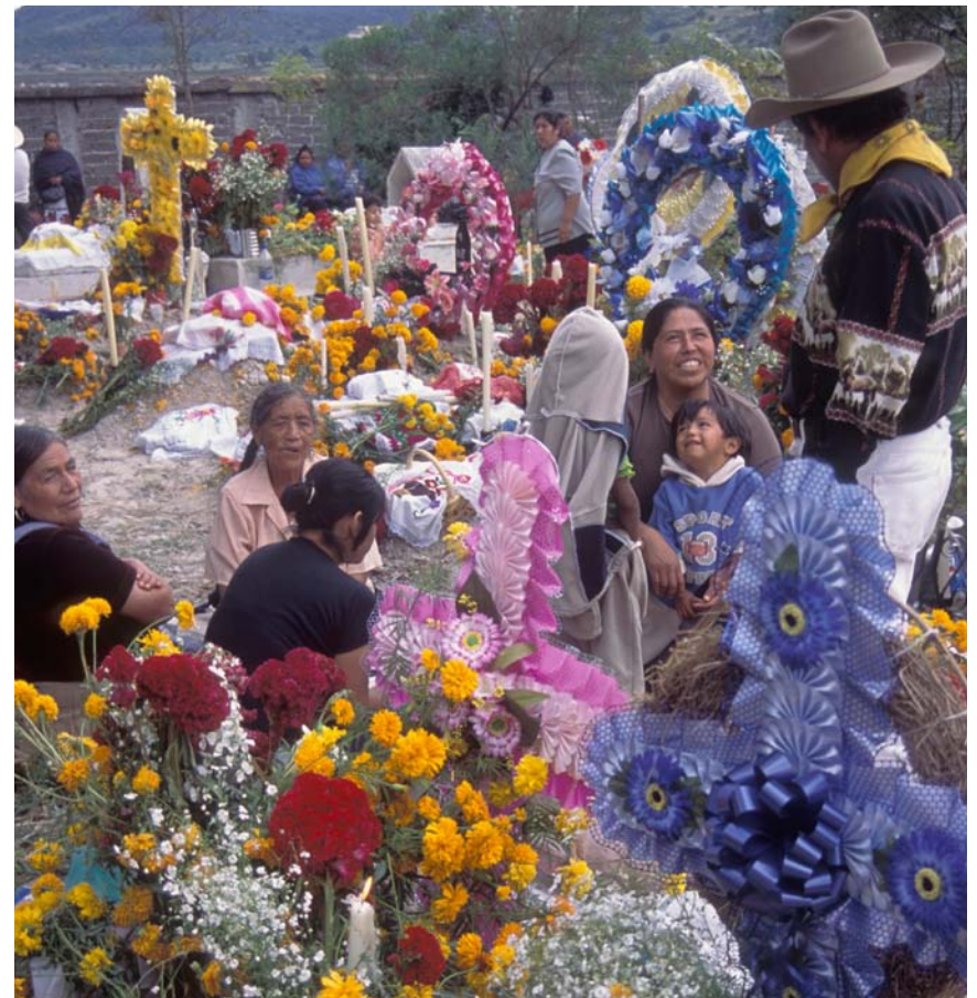
A family in Mexico brings flowers and food to celebrate Día de los Muertos in a cemetery.