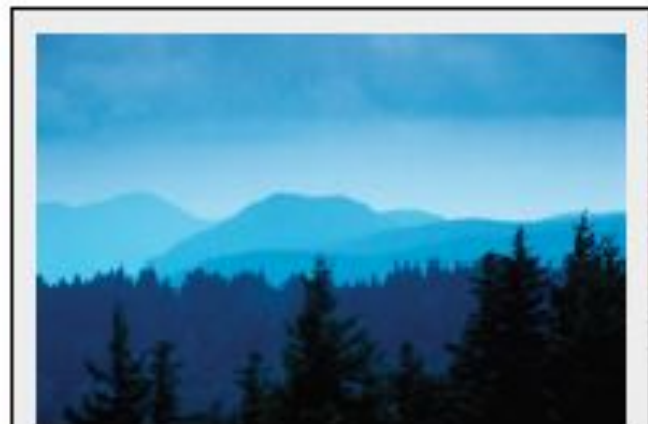
The Appalachian Mountains are one of the oldest mountain ranges in the world.

There are twelve states in the Southeast region. Georgia is the largest state in the Southeast, but Florida has the most people.