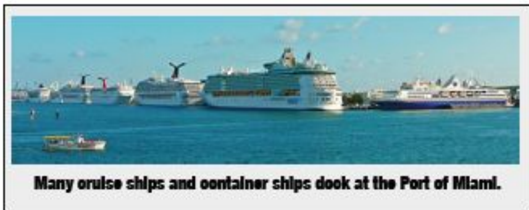
Many cruise ships and container ships dock at the Port of Miami.

transportation. Many port cities have grown up along the coast where rivers reach the sea. One of the busiest port cities is Miami. Miami is located near the southern tip of Florida. The port of Miami is also home to many cruise ships. Each year, more than three million people leave Miami on cruise ships for vacations at sea. No wonder Miami is also known as the "Cruise Capital of the World."