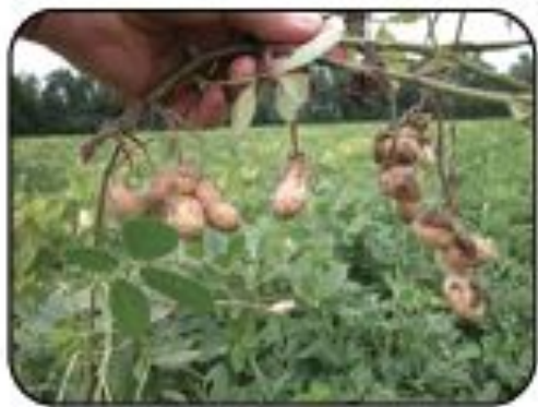
Almost half of the peanuts grown in the US are grown in Georgia.

The Southeast is rich in natural resources. Natural resources include land, oceans, forests, minerals, and fuels. Land was the first natural resource that attracted people to the Southeast. Growing crops and raising animals was the Southeast's largest industry for many years. An industry is all the businesses that produce one kind of good or provide one kind of service. Today, many industries are important to the region, including the coal-mining industry, the steel-making industry, the lumber industry, and the oil industry.