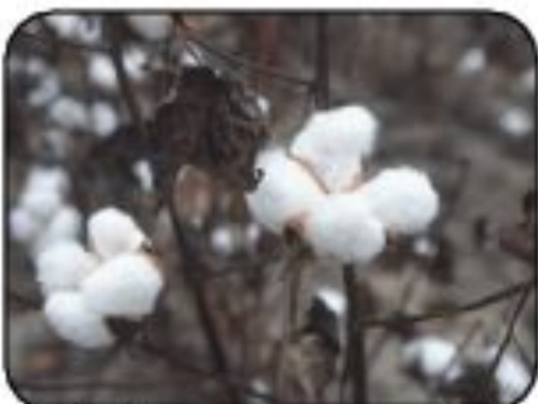
Cotton is one of many crops that are produced in the Southeast.

Agriculture, the business of growing crops and raising animals, is an important business in the Southeast. The Southeast is good for growing crops because of its flat land, rich soil, and long growing season. Southern farmers can grow crops for most of the year. Everyone loves Georgia's peaches and Florida's citrus fruits! Other farmers produce rice, cotton, tobacco, sugar cane, and peanuts. Because it produces so many food products, the Southeast has also become a center for food processing.