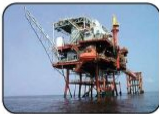
Oil rigs can be seen from shore along the Gulf of Mexico.

Trees are also raised as a crop. In North Carolina, trees are used to make furniture. More than half of the furniture sold in the United States is made in High Point, North Carolina. In Georgia, Arkansas, and Alabama, people use trees to produce lumber and paper.