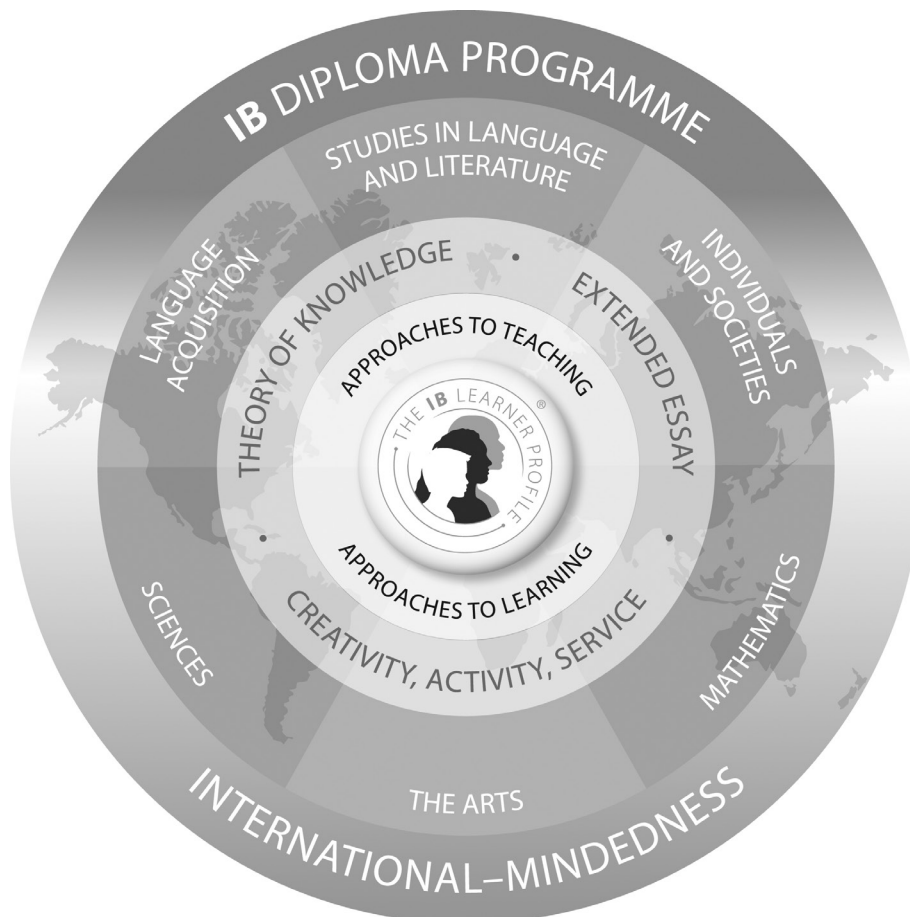
Figure 1 Diploma Programme model

The course is presented as six academic areas enclosing a central core (see figure 1). It encourages the concurrent study of a broad range of academic areas. Students study two modern languages (or a modern language and a classical language), a humanities or social science subject, an experimental science, mathematics and one of the creative arts. It is this comprehensive range of subjects that makes the Diploma Programme a demanding course of study designed to prepare students effectively for university entrance. In each of the academic areas students have flexibility in making their choices, which means they can choose subjects that particularly interest them and that they may wish to study further at university.