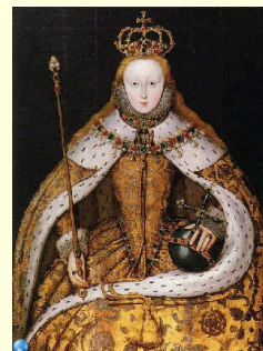
Horrible Histories - Queen Elizabeth's Dating Site