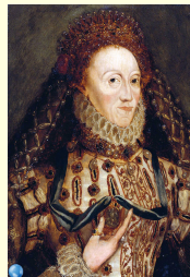
Elizabeth: The Golden Age Movie Trailer

The queen's beliefs in Renaissance ideas and love of the arts helped pave the way for many artists, writers, playwrights, and explorers of the time.