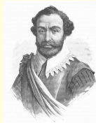
Sir Francis Drake

Queen Elizabeth financed many of her favorite plays and also explorers such as Sir Francis Drake.