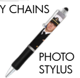
PHOTO STYLUS PEN

PLEASE DO NOT CUT FORM. PLACE ORDER FORM AND PAYMENT IN ENVELOPE.