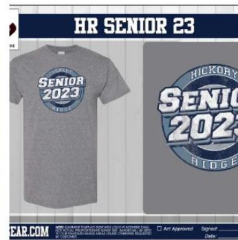
Class of 2023 T-Shirt $15.00