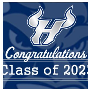
Class of 2023 Yard Sign $21.00