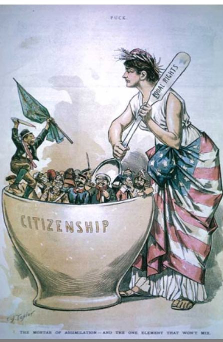
An 1889 political cartoon from Puck . It shows Lady Liberty attempting to stir the mortar of assimilation, but one element- Irish Americans- refuses to mix.