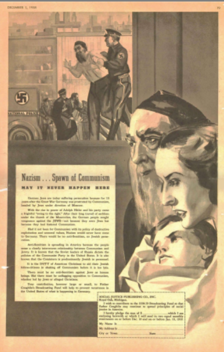
A 1938 political cartoon from Social Justice . Refers to Nazism as the spawn of communism and suggests that Jews brought about Nazism by being Communists and suggested the risk of allowing European Jews to immigrate to America.