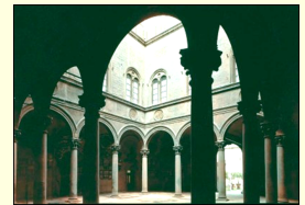
Medici Palace in Florence, Italy where Michelangelo lived and worked at age 14