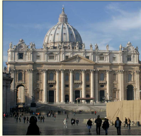
St. Peter's Basilica (Rome, Italy) Video

And at the end of his life he became very religious.