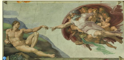
Tour of the Sistine Chapel

At age 33, Michelangelo painted the ceiling of the Sistine Chapel in the Vatican in Rome. Lying on his back high in the air, Michelangelo spent four long years painting the ceiling.