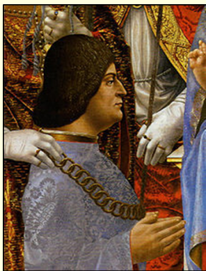
Lodovico Sforza, the Duke of Milan

At age 30, Leonardo moved to Milan to work as court artist for Lodovico Sforza, the Duke of Milan. For 17 years, the Duke allowed Leonardo to pursue any project that captured his imagination. As a result, Leonardo became a “Renaissance Man” – artist, mathematician, anatomist, engineer, and inventor.