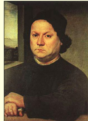
Andrea del Verrocchio

At age 13, he was apprenticed to Verrocchio, the leading painter and sculptor of his day. Every day, the two worked together on the same painting. One morning Verrocchio took a peek at Leonardo's work and realized that Leonardo's talent had surpassed his own. He resolved to never touch a paintbrush again. The student had outshone the teacher!