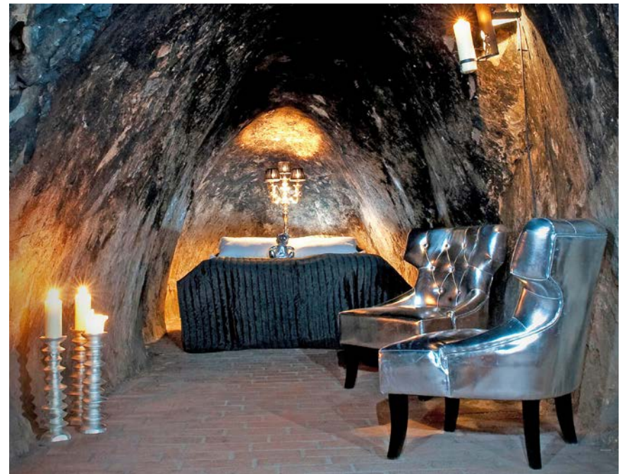
Candles light up the dark, stone underground room.

One tree house looks like a big bird's nest. The UFO tree house looks as if it is from outer space.