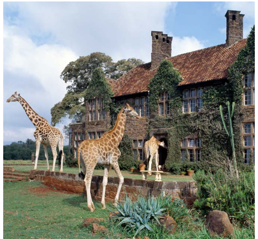
Three giraffes stop by Giraffe Manor for breakfast.

The ice melts away in the spring. Each winter, it takes a lot of work to build the hotel again.