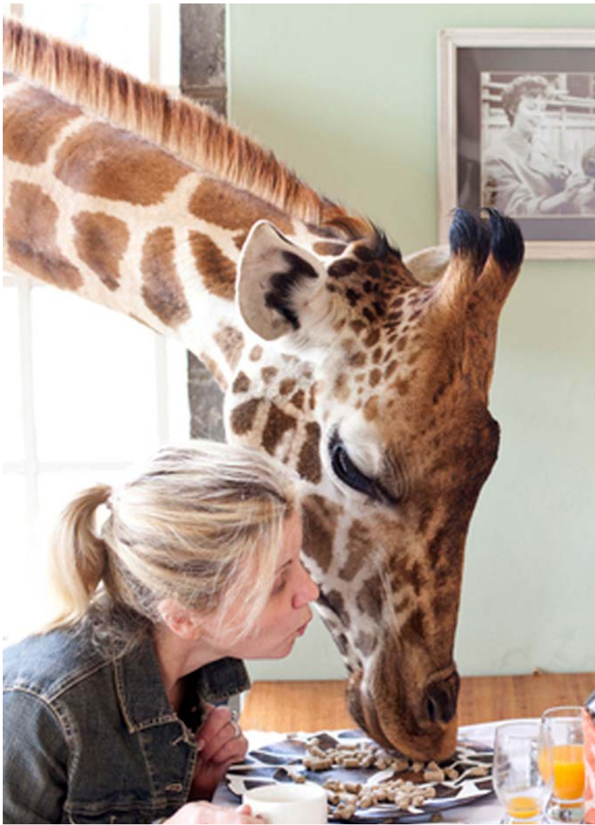
A hungry giraffe eats food from a woman's plate.