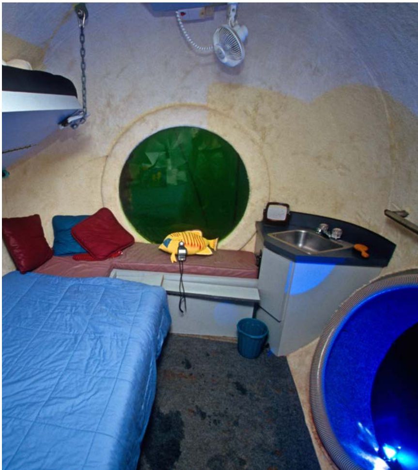
Visitors can watch for fish through a round window.