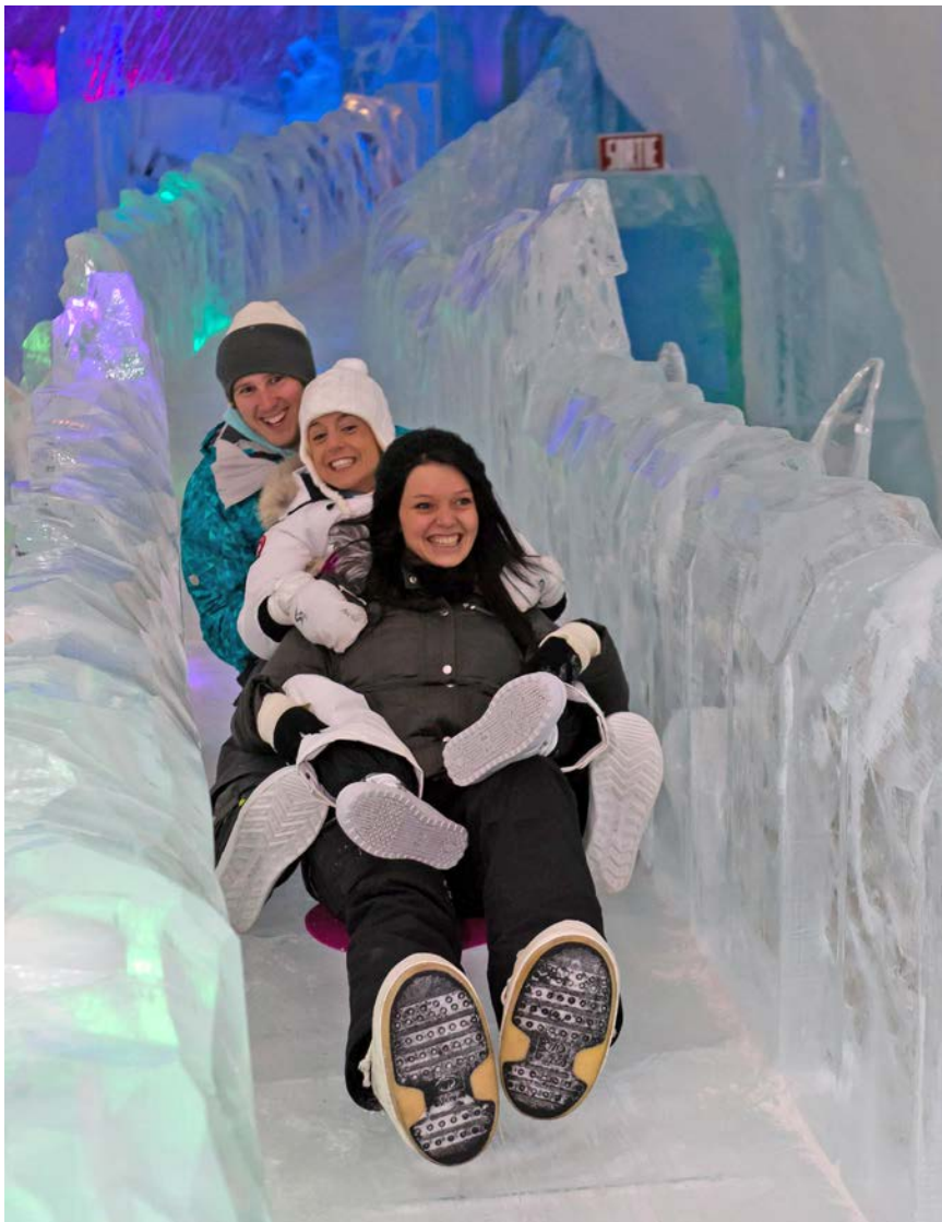
Take a ride on the indoor ice slide.

The ice melts away in the spring. Each winter, it takes a lot of work to build the hotel again.