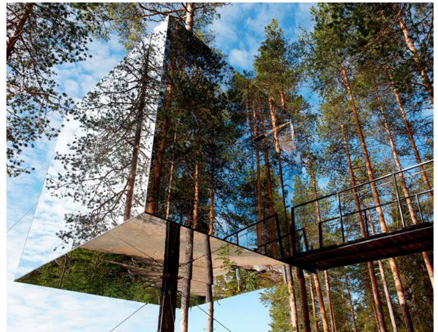
Can you spot the Mirrorcube among the treetops?