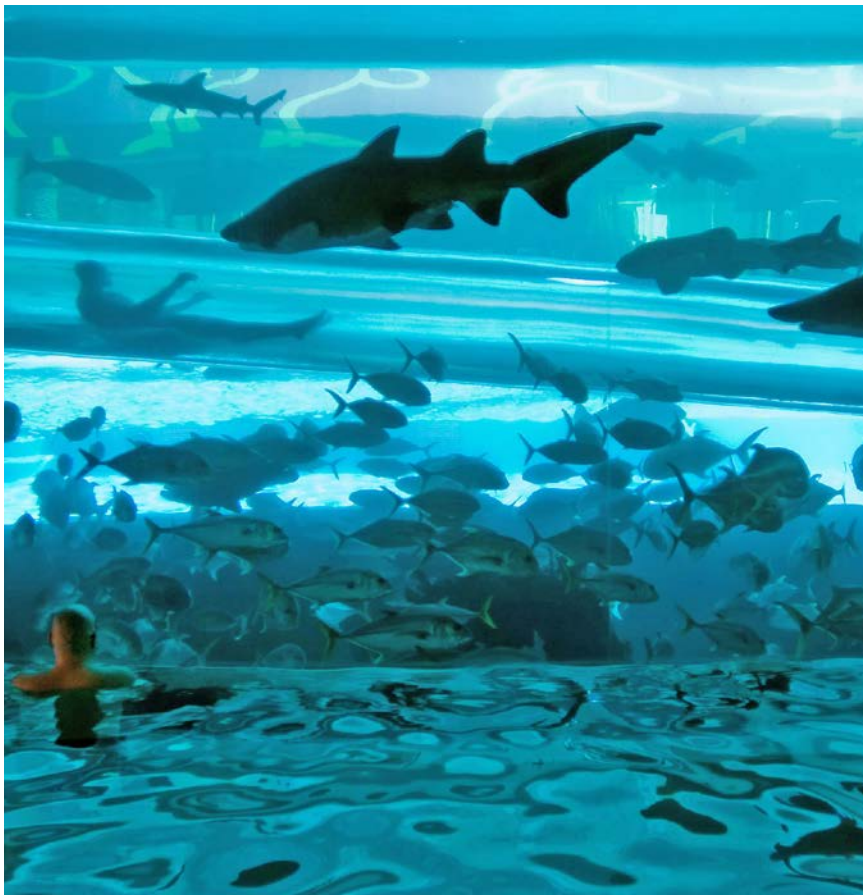
A visitor slides through a shark tank at the Golden Nugget.