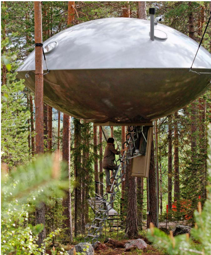
A visitor climbs a ladder to enter the UFO tree house.

One tree house looks like a big bird's nest. The UFO tree house looks as if it is from outer space.