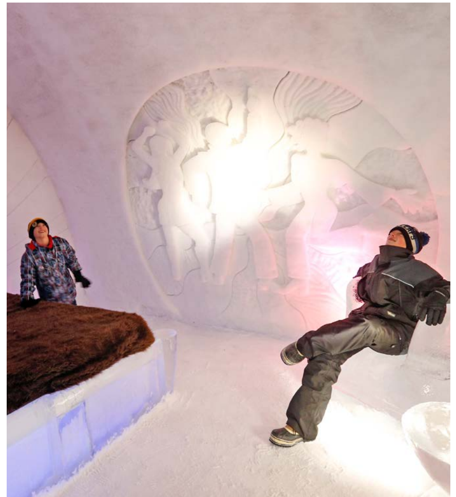
An artist made a picture on the ice wall.