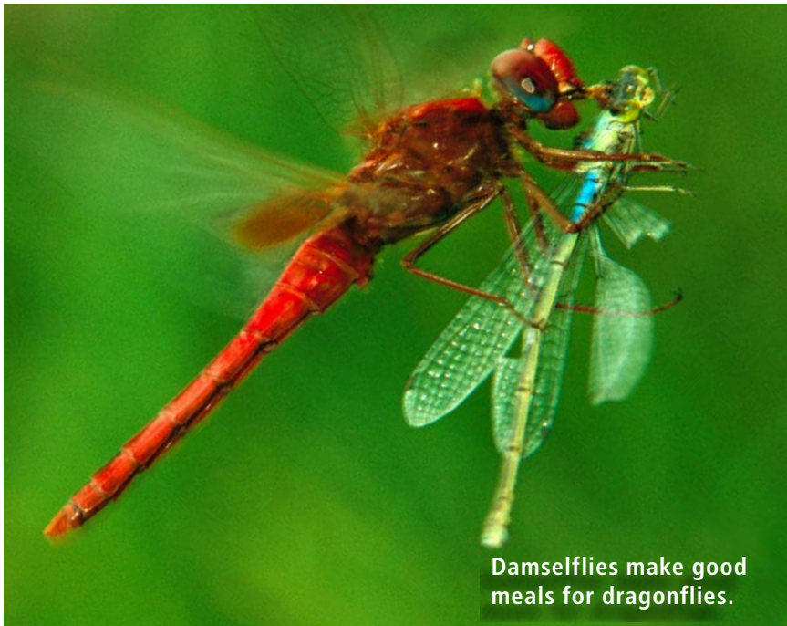
Damselflies make good meals for dragonflies.