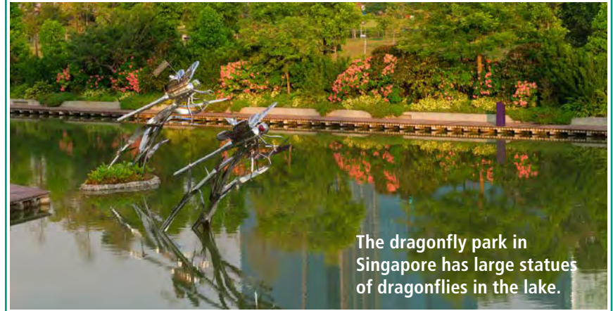
The dragonfly park in Singapore has large statues of dragonflies in the lake.

In 1985, people in Japan created the world's first dragonfly park. Today there are also dragonfly parks in Europe and the United States. Dragonflies are amazing creatures—and people all over the world are starting to realize it!