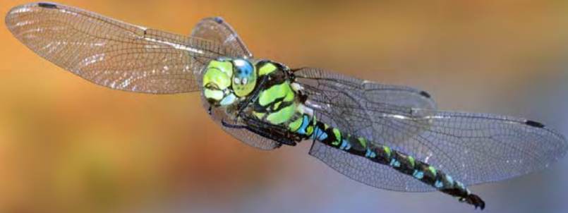
southern hawker dragonfly