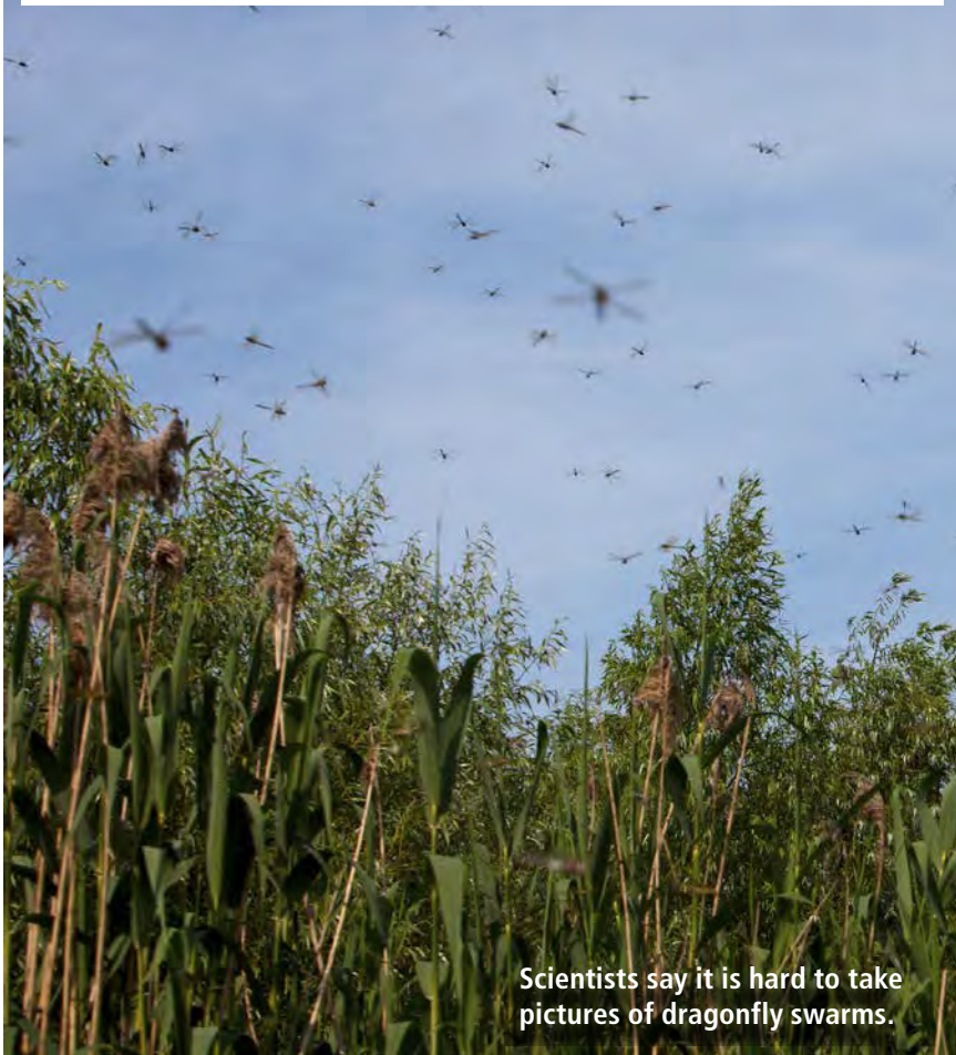
Scientists say it is hard to take pictures of dragonfly swarms.

Dragonflies sometimes travel in huge groups, called swarms . They travel in swarms for food and to go south for the winter.