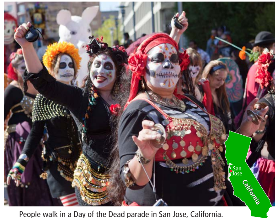
People walk in a Day of the Dead parade in San Jose, California.