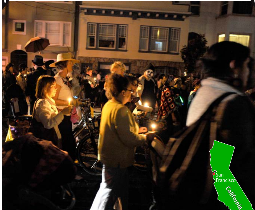
People walk in the Day of the Dead parade in San Francisco, California.

In San Francisco, California, about 15,000 people carry candles and photos of loved ones who have died. Austin, Texas, has a large parade and costume contest to celebrate Day of the Dead. In Tucson (TOO-sawn), Arizona, more than 30,000 people march in a parade.