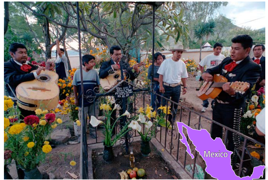
A band plays in a cemetery for Día de los Muertos in Mexico.