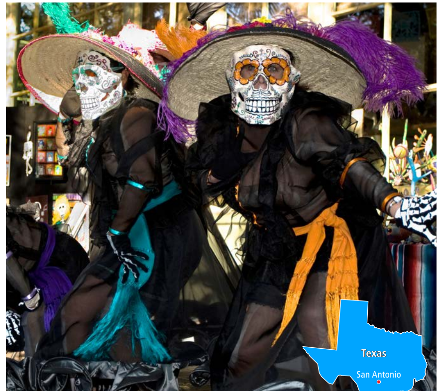
These dancers show off their painted skull masks at the Day of the Dead parade in San Antonio, Texas.

In the days before the parade, Lidia makes masks. She shreds newspaper and soaks it in water. She mixes the wet newspaper with flour and glue. Lidia turns the mixture into masks. When the masks are dry, children and adults paint them and wear them in the parade.