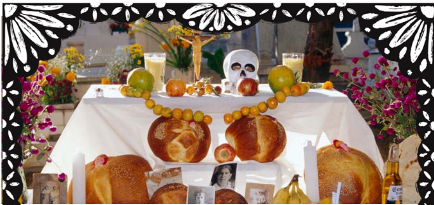
An altar decorated with pan de muertos and other foods

The family lights candles around the altars. They also make bread called pan de muertos , or “bread of the dead,” for the altars. A family may also leave a favorite juice or other drink. Orange and yellow marigolds or other flowers, skeleton toys, and dolls also decorate the altars.