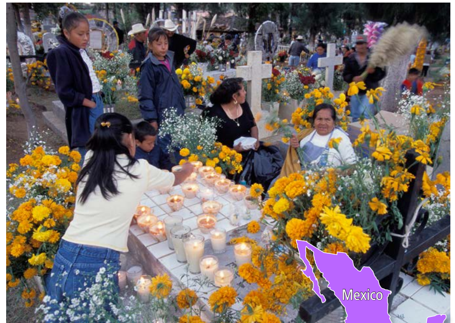
A family visits and decorates the grave of a loved one for Día de los Muertos in Mexico.