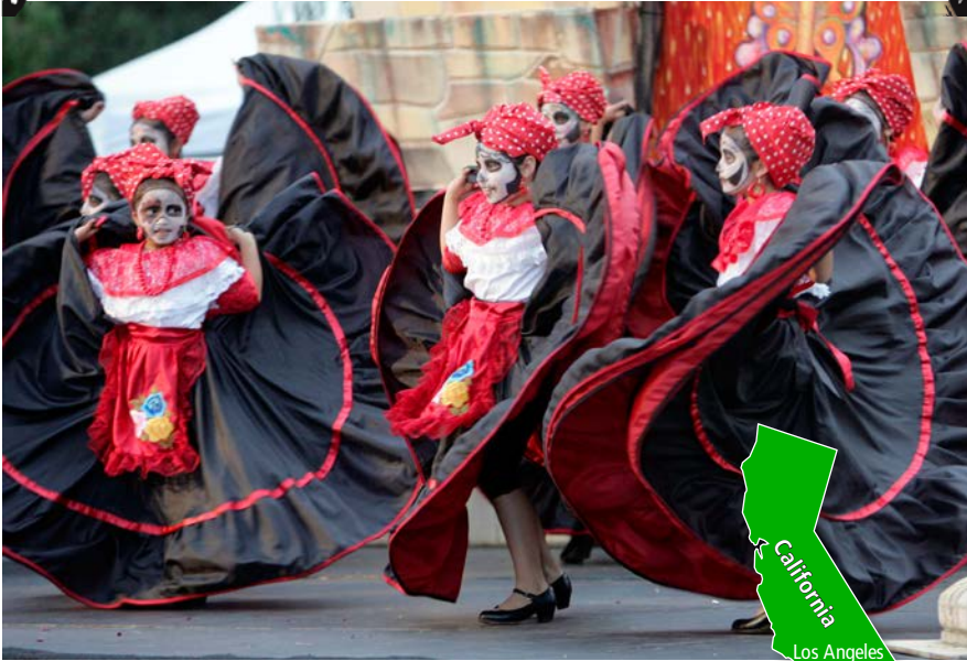
Children perform at a special Day of the Dead festival in Los Angeles, California.

Día de los Muertos helps people to feel better after losing someone they love. Marching in a parade or decorating altars can help them remember that special person. No other holiday is so full of fun, costumes, life, masks, joy, memories, and love.