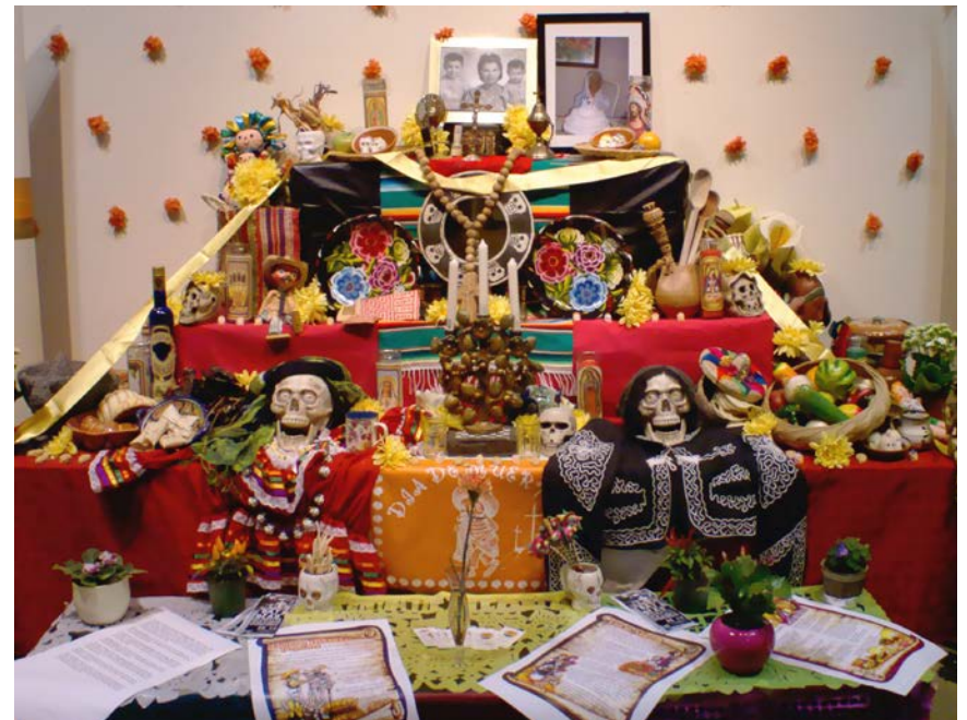
An altar decorated for a loved one in a family member's home