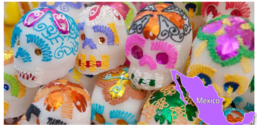
Handmade sugar skulls are displayed at a market in Mexico.