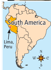
A boy performs a traditional “scissors dance” for Día de los Muertos in Lima, Peru.