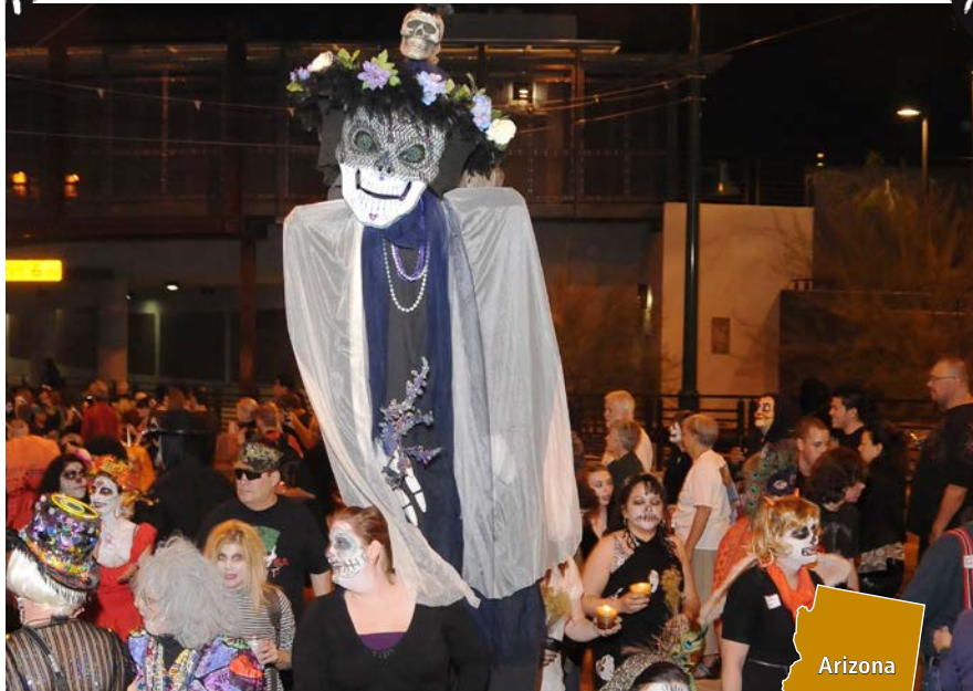
One of the many puppets in the Tucson, Arizona, parade stands above the crowd.