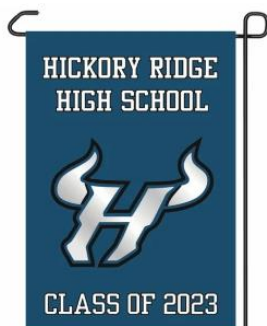
Class of 2023 Garden Flag $21.00

https://my-site-101942-101991.square.site/s/shop