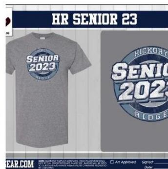
Class of 2023 T-Shirt $15.00