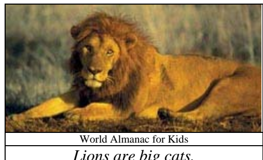
Lions are big cats.

The savanna is a habitat . A habitat is a place where an animal lives. Here are some animals that live in the African savanna.