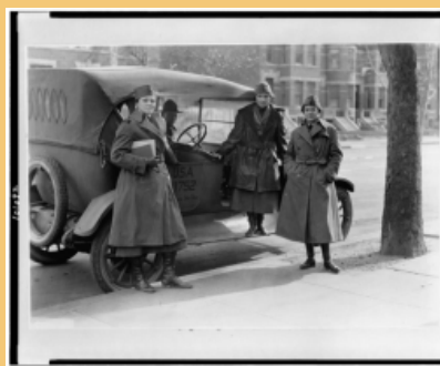
The woens radio corps