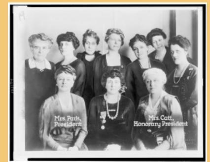
National League of women voters board