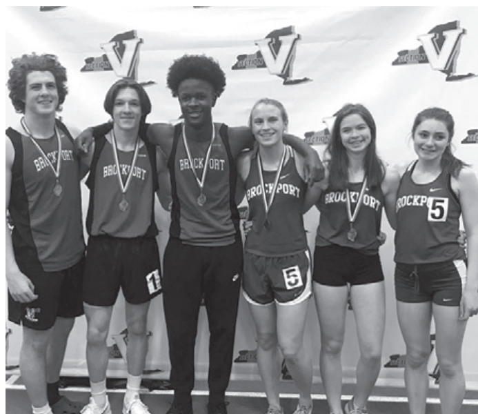
Indoor Track NYS representatives

Thank you to all staff, athletes and community members who came out to support our Spring Senior Athletes' Parade in honor of our senior spring athletes who lost their season due to COVID-19. Jerseys and banners hung along the route, and all the scoreboards were glowing with 2020.