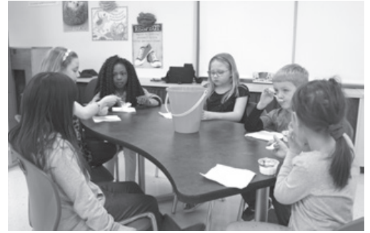
January 2020 Bucket Filler Celebration

A handful of Bucket Fillers were also recognized for earning drops in the office bucket. Students earned drops from staff members for a variety of reasons and were called to the office each morning over the announcements to receive a pencil for their achievement.