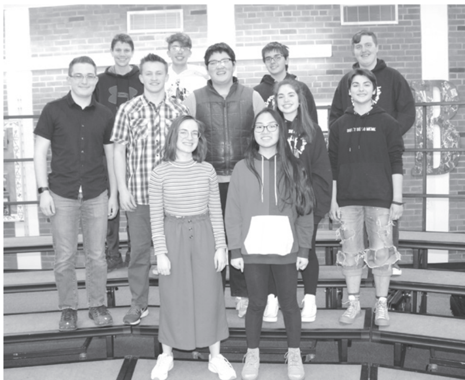
February 2020 MCSMA Jazz All-County