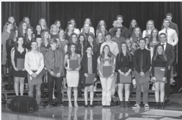
2020 BHS National Honor Society inductees