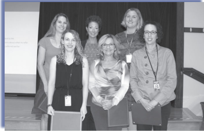
Ginther service award recipients

For a complete list of honorees and photos, visit bcs1.org/openingday2017 .