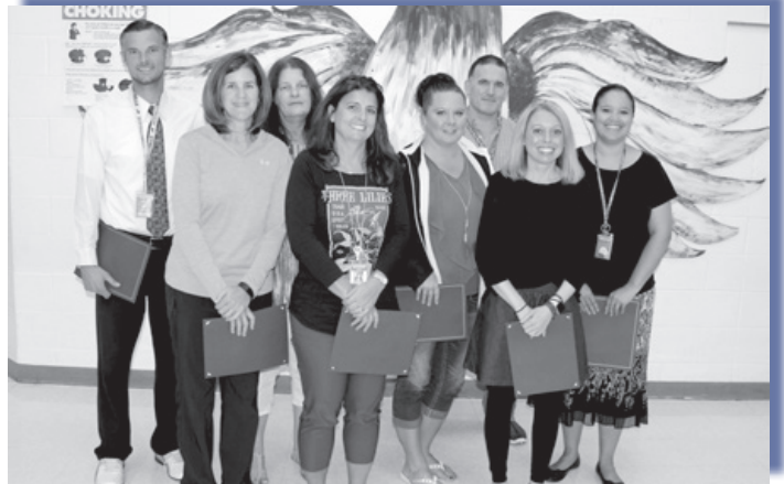
Hill service award recipients

Brockport Central School District recognized 112 staff members for 10, 15, 20, 25, 30 and 35 years of service during Opening Day for staff on Aug. 30. Combined, that equals 1,750 years of service. Honorees were presented with their certificates during their department meetings this fall.