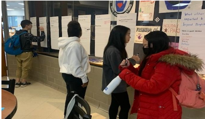
Brighton HS students engaging in the process of helping us define our key PoG attributes!