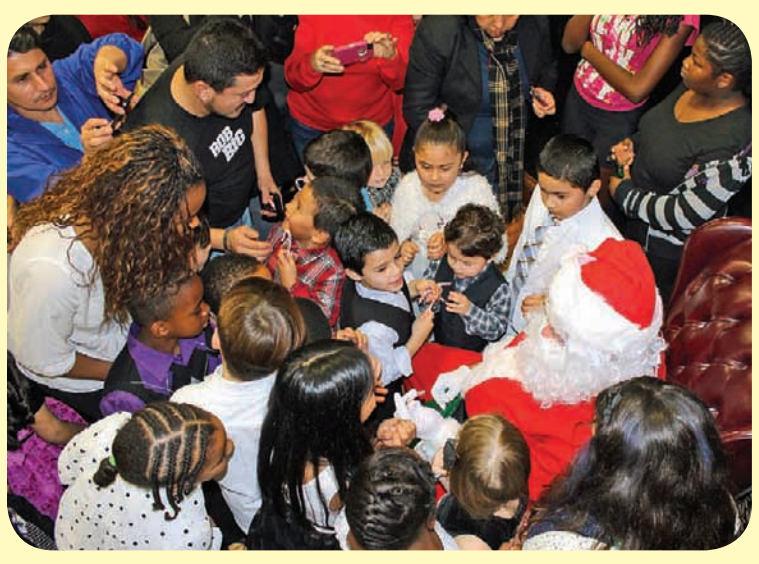
An after-performance Santa Crush.