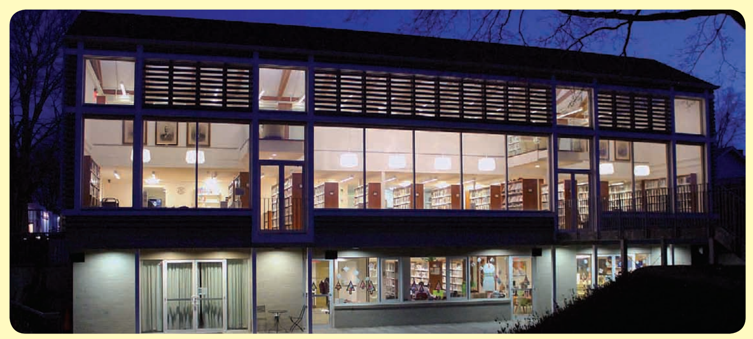
The Hampton Library is now open till 9 p.m. Monday through Thursday, and till 6 p.m. on Friday.