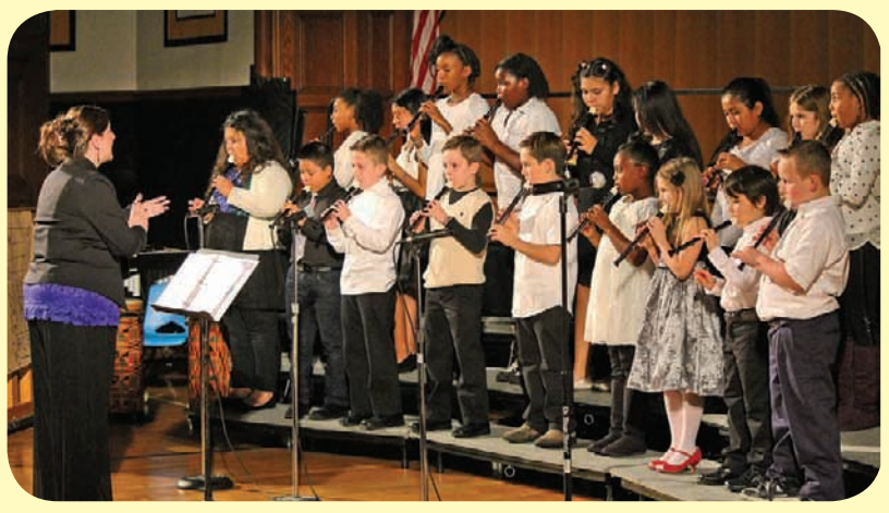
The elementary chorus performed the holiday classic "Jolly Old Saint Nicholas" in two-part harmony on soprano recorder.