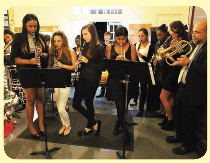
The Instrumental Caroling Group performing in the school lobby.