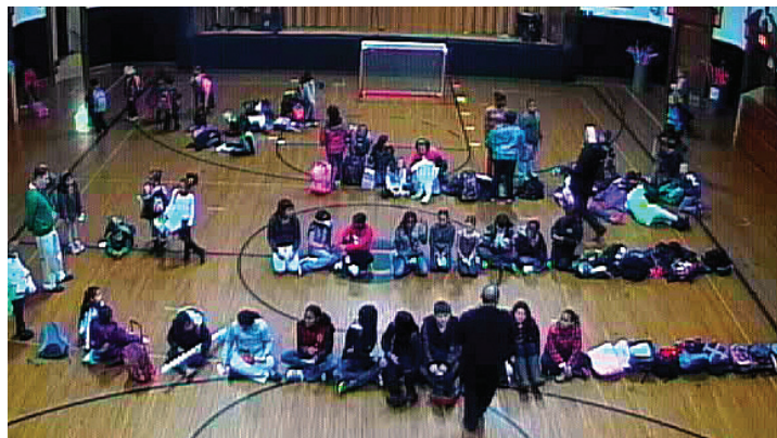
Role models caught on video: 6th-graders setting a front-row example of organization