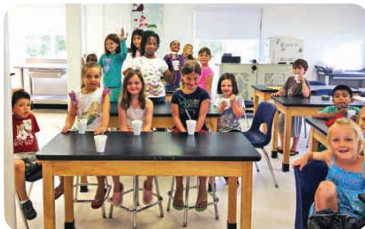
The cast of Stone Soup in the Middle School Nutrition and Culinary Room merrily making...stone soup.

On July 19th, camp culminated with a concert on the gym stage, with students performing songs by The Beatles, Oasis, Coldplay and others.