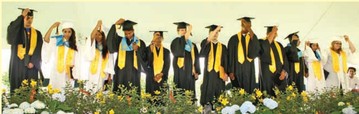
Time for that all-important adjustment; let me see if I can get this right...