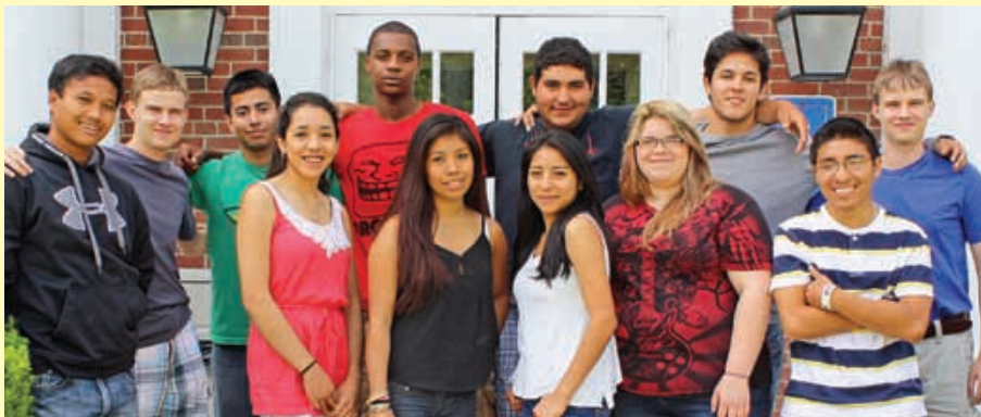
Seniors gathered before the school entrance in mid-June for their official informal Class of 2013 photo.