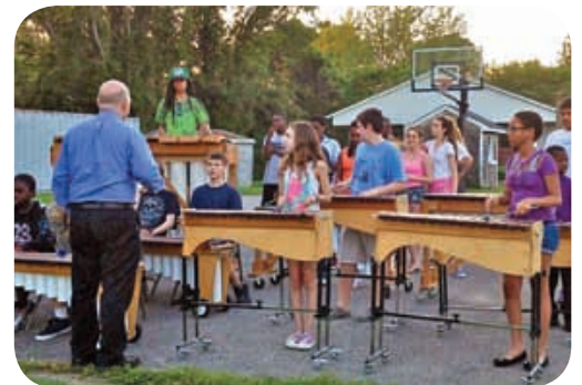
An early performance by the Marimba Band.

for many when she said, "This is an important event for me personally, as my family has survivors to be celebrated and loved ones to be honored. My team has three members on it who were diagnosed before the age of 50 with cancer, and who are currently cancer free." As