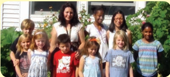
Summer 2013's JumpStart class had so much fun learning together, they vowed to return next summer.