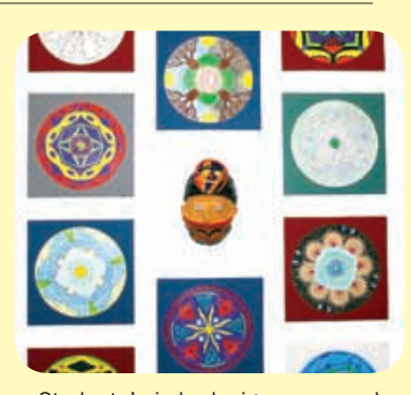
Students' circle designs surround a ceramic mask created by sophomore Jada Pinckney.

ed relief tiles created in conjunction with a field trip to the Longhouse Reserve, appeared in Robin's article "Tile Inspirations" in Arts & Activities , "the nation's leading art education magazine." In the magazine's generous spread, Robin outlines