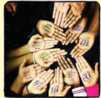
Blue Pinky and Write Nice "Mean Stops Here" Instagram posts

Instagram (@Bridgehampton-CIA) and the Mean Stinks website (www.meanstinks.com). As a culminating event, students in grades 6 through 12 met in the middle school large room to view