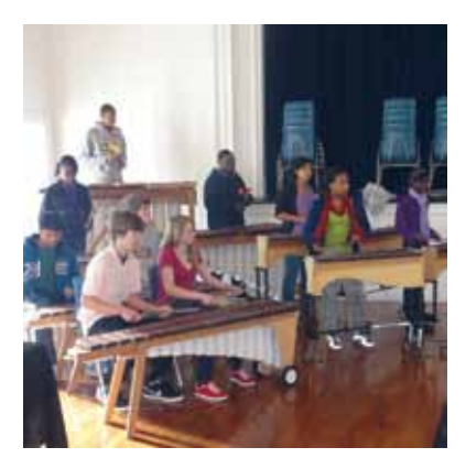
The Marimba Band performs at the Bridgehampton Community House

has been in high demand this past year, performing regularly at Bridge Gardens, The Bridgehampton Community House, CMEE, local festivals and other special-event venues. This summer, the Marimba Program welcomed new members to the band and met regularly in