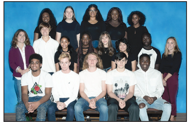
CLASS OF 2019