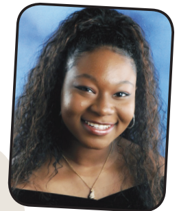
MONASIA STREET Have a clear mind and soul!