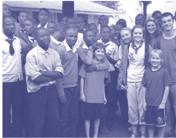
Taking a break from their health data collection, BHS students experience a social exchange with Kenyan students.

After spending seven months learning about Africa and how to conduct health surveys, 17 BHS students and three BHS teachers spent 19 days living on a farm in Kenya. Their purpose: survey the neighboring impoverished villages to present a "health profile" that would provide data for medical care and health education. Read more on the website about this service and the students and teachers involved.