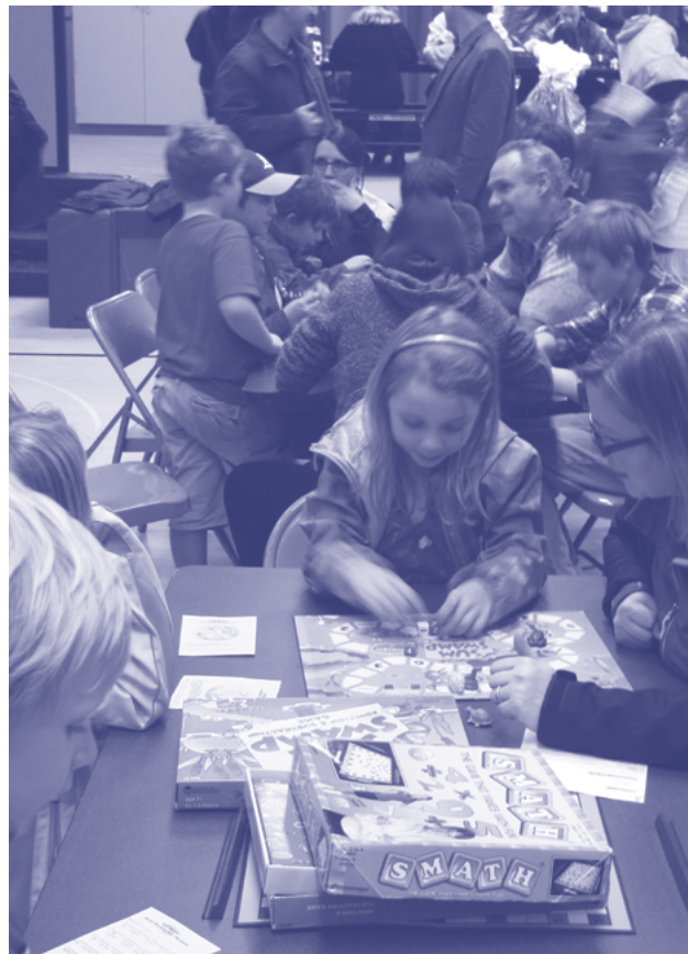
Above: Kids and parents are enthusiastically engaged in math games at Blakely's first Family Math Night.

Excitement about math is palpable in our elementary schools! Take the framework for the K-6 Mathematics Program Review, add the outcomes of ST (Spatial Temporal) and ZENO math opportunities, and no wonder there's excitement.