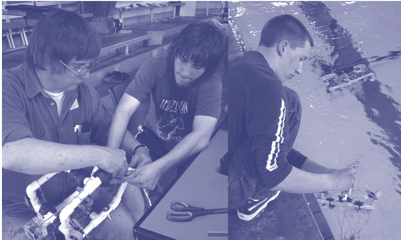
A student works with a Lockheed Martin volunteer, while another completes his final ROV design adjustments.

THANKS TO a partnership between the Bainbridge Island School District and the Naval Undersea Museum Foundation - Science Education Alliance (NUMF-SEA), our students have access to cutting edge technology, local experts, and engaging hands-on science projects.