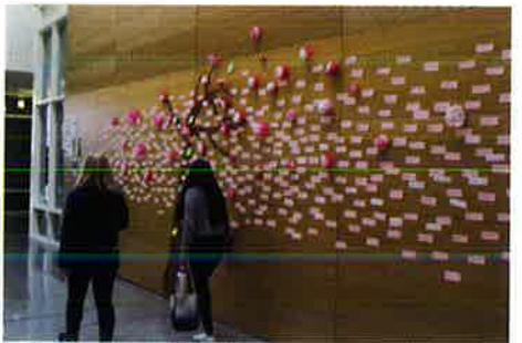
APRIL ▼ The Tree of Gratitude was in full bloom at BHS. On the blossoms were words of appreciation from students to staff.