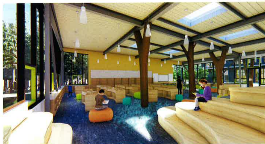
The architect's rendering of some of the new building's interior spaces. The building is designed to take advantage of natural daylight and feel closely tied to the outside. (Courtesy of Mithun)