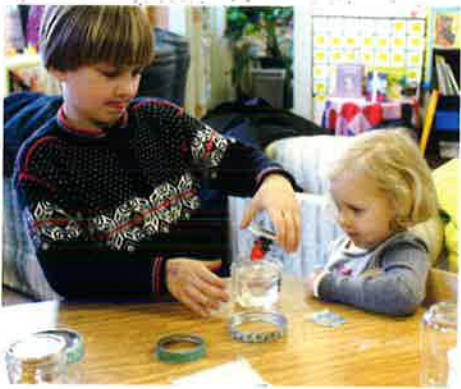
▲ Mosaic Home Education Partnership held its annual Craft Festival and students and families created projects and long-lasting memories.