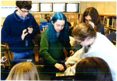
FEBRUARY ▲ Tenth graders were issued a Chromebook to assist with their school work both in and out of the classroom. BISD students in 7th-10th grades now have take-home devices. That equals almost 1,400 Chromebooks!