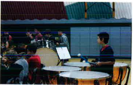
▲ The Woodward Middle School Band performed the Marches of the Armed Forces at its Veterans Day Assembly.