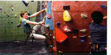
▼ Eagle Harbor High School students scale new heights during physical education class.