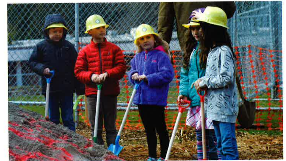
▲ An historic moment: Blakely students helped break ground for the new school. ▼ The architect's rendering of the exterior of the new Blakely Elementary. The new building is being built behind the current Blakely. (Mithun)