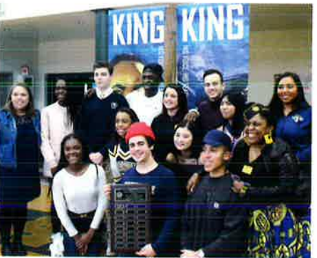
JANUARY ▼ The Martin Luther King Jr. Assembly at BHS is always inspiring and this year's included a motivational speaker, student performances in song and dance and an award ceremony.