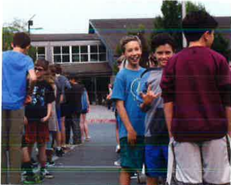
OCTOBER ▼ Ordway Otters enjoy the fall sunshine while participating in their annual jog-a-thon. Each class had their own theme, like these Otters who made a splash!