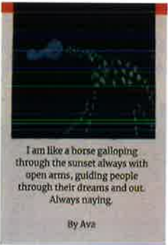
◀ For poetry month, Ordway poets wrote heartfelt prose. I am like a horse galloping through the sunset always with open arms, guiding people through their dreams and out. Always naying. By: Ava