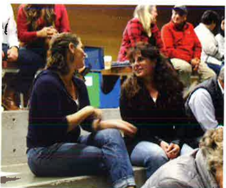
▲ BISD launched a Social and Emotional Health initiative this year and held a parent seminar to share ideas with the community on ways to enhance students' sense of well-being.