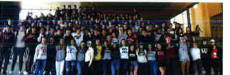
MAY ▲ BHS Decision Day! Seniors gather wearing sweatshirts from their soon-to-be schools.