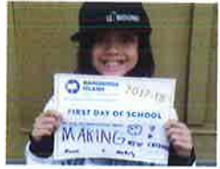
SEPTEMBER ◀ On the first day of school, this fourth-grader was most excited about making new friends.