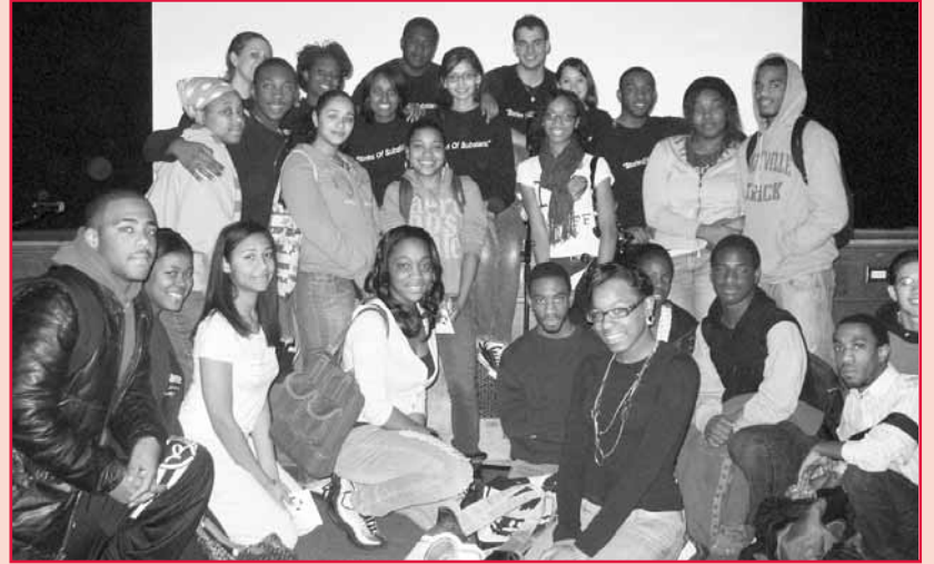
Amityville students got up close and personal with the SOS peer educators.

Making the right choices results in positive consequences. This was the message delivered to students by the Nassau County District Attorney's Office during their program, Choices and Consequences. The presentation is designed to steer students away from substance abuse, using graphic footage of automobile accidents and testimonies from young people who have been arrested for drunk driving incidents. Students are advised that if they choose to disregard the important message discouraging substance abuse, they should at least have a plan for getting home safely. After the assembly, students were provided with an overview of the laws governing drunk driving. Some students even volunteered to wear 'beer goggles,' used by the police to provide a true perspective of how alcohol abuse can temporarily impair a person's vision, and subsequently, his or her reactions.