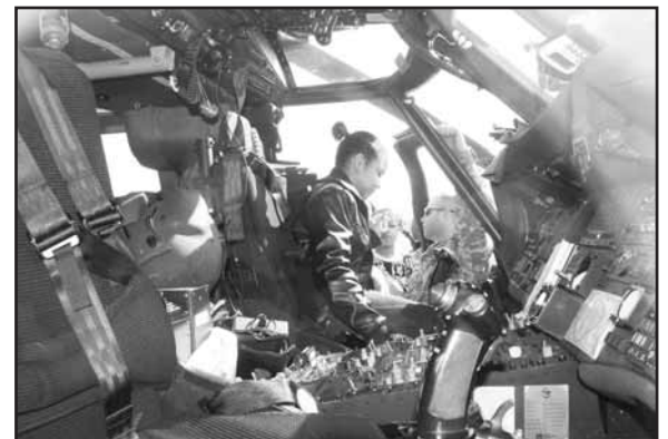
Students had the opportunity to get a close-up look at the controls of the chopper.