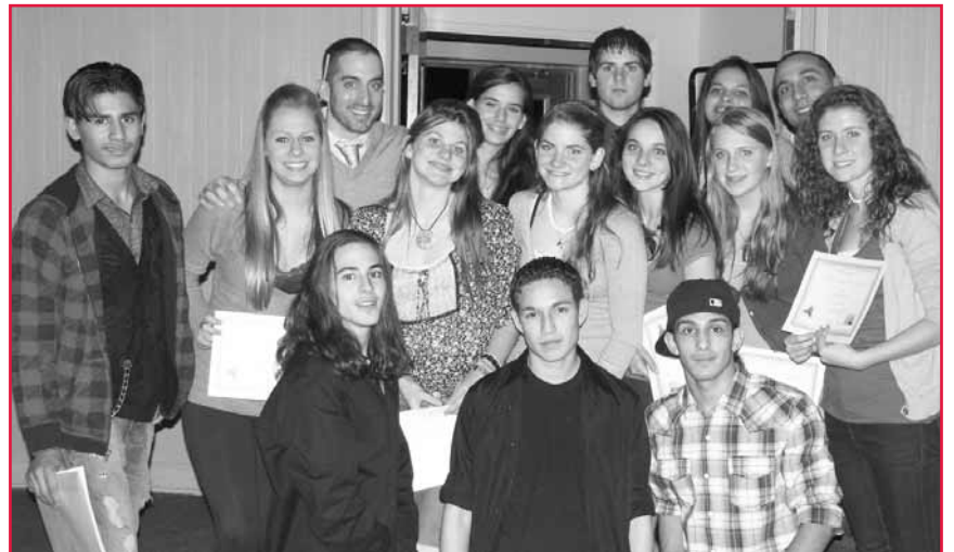
Members of the Boys and Girls Varsity Soccer teams earned New York State Scholar-Athlete status for maintaining a GPA of 90% or higher during their respective seasons.