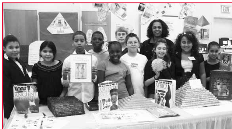
Students show some of the items they created and displayed in their own museum of ancient Egypt.

To begin their studies, students visited the Egypt Room at the Vanderbilt Museum in Centerport. Ms. Graham gave students a list of seven assignments from which to choose one, all of which required them to research and prepare a creative project. While some students chose to construct pyramids, others created board games modeled after Egyptian recreational customs or wrote and illustrated magazines depicting ancient Egyptian fashion. For the presentation of their projects, students collectively put their work on display in their own little museum, having been inspired by the Vanderbilt trip and a Q & A with the curator.