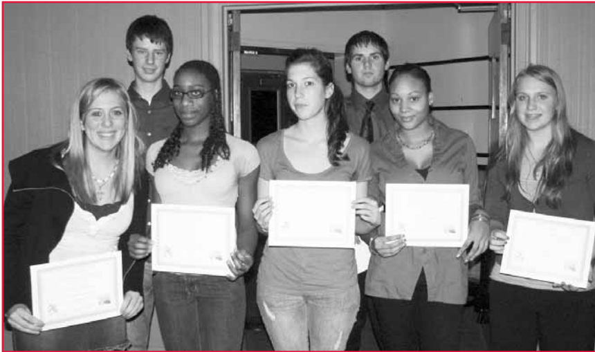
The district's "All-Academic Team" is made up of athletes from various sports who maintain a GPA of 90% or better during their respective seasons.