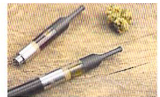
Vape Pen used with THC oil