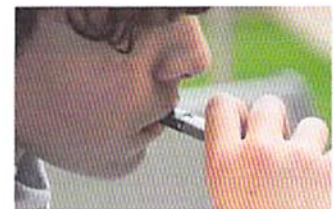
Teen using a JUUL

Nearly 1 in 3 high school seniors tried vaping in the past year.