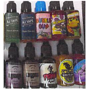
Flavors are one of the biggest attractions for vaping.

Boredom is another reason cited by many teens. It can be habit-forming, much in the same way teens check their phones in free moments. It's easy to take a quick puff.