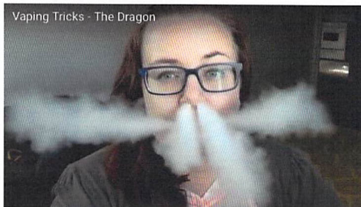
Vaping tricks are another major attraction of vaping.

Teens are increasingly becoming interested in "cloud competitions," in which adults compete to perform the best vaping tricks. In addition to being featured on social media, cloud competitions are becoming a regular feature at local vape shops with some offering thousands of dollars in prize money.