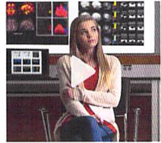
□ Is vaping safe? Watch this short video from the CDC.

The report highlights that most e-cigarettes contain and release a number of potentially toxic substances, although exposure to these substances is considerably lower than those found in regular cigarettes.