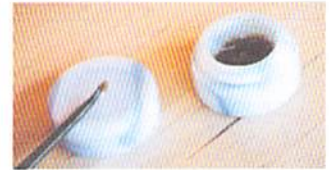
Dab, a concentrated form of marijuana with dab tool

Research also shows that about 1 in 6 teens who repeatedly use marijuana can become addicted, as compared to 1 in 9 adults. Further, kids who vape are more likely to use combustible cigarettes and try marijuana than their non-vaping peers.