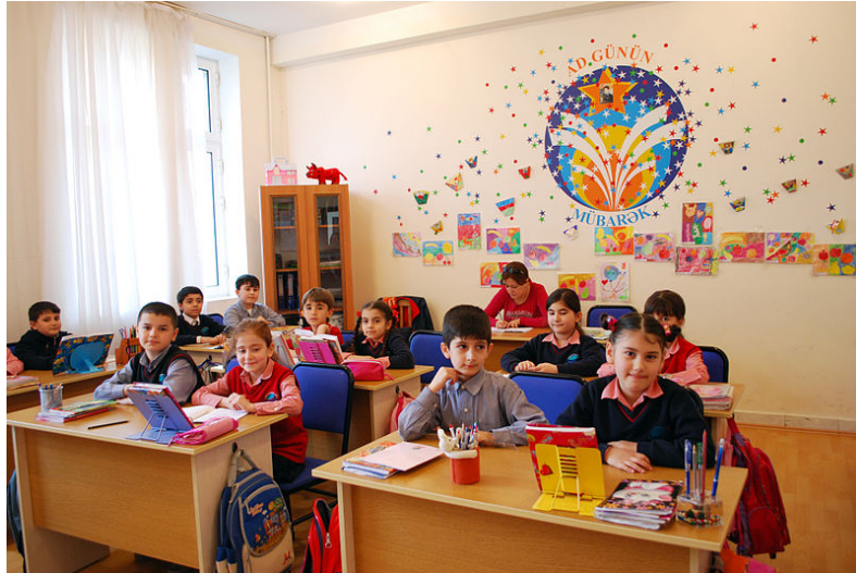
Photo: Dünya School students in a classroom in Azerbaijan. January, 2011. ©2011 by Buyerlerdeqalardim in en.wikimedia. Some rights reserved ( http://creativecommons.org/licenses/by-sa/3.0 ).

In 1901, California passed a law against giving homework to kindergarten through 8th grade students. The lawmakers argued that children needed time for fresh air and exercise after school. The law also limited how much homework high school students were given.