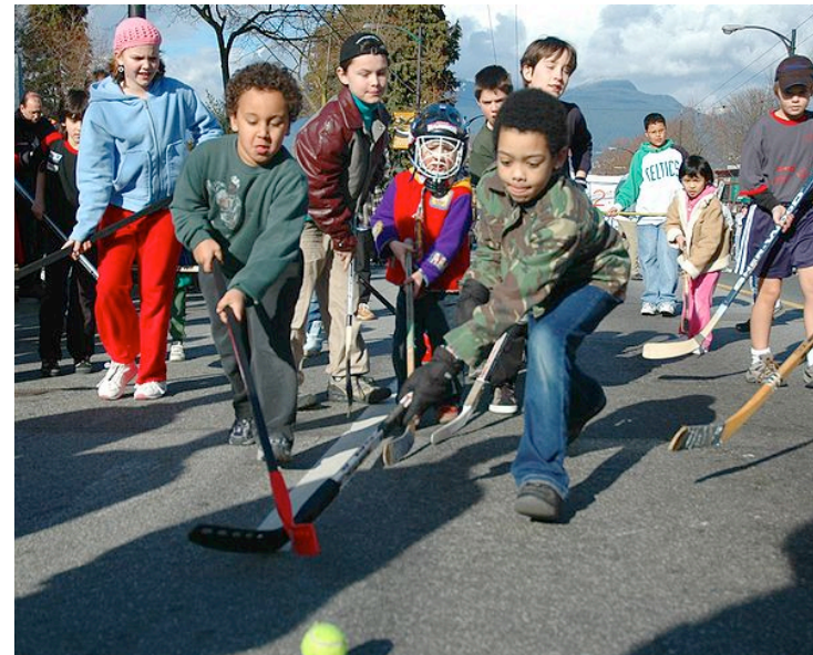
Photo: Children playing street hockey, Vancouver, Canada. February, 2005. ©2005 by Pete in en:Wikipedia. Some rights reserved CC-BY-SA-2.0 ( www.creativecommons.org/licenses/by-sa/2.0 ).

For more information about Talking Points for Kids (© Elfrieda H. Hiebert), visit www.textproject.org . Some rights reserved ( http://creativecommons.org/licenses/by-nc-cd/3.0/us/ ).