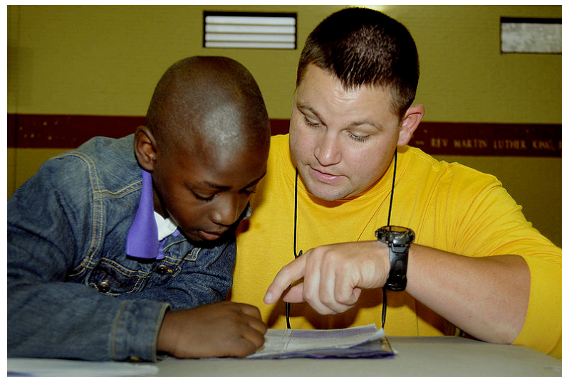
Photo: Help with homework. Charleston, SC. April, 2010.