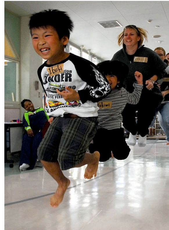
Photo: Children from the Kadena Children's Center jumping rope. Okinawa, Japan. February, 2010