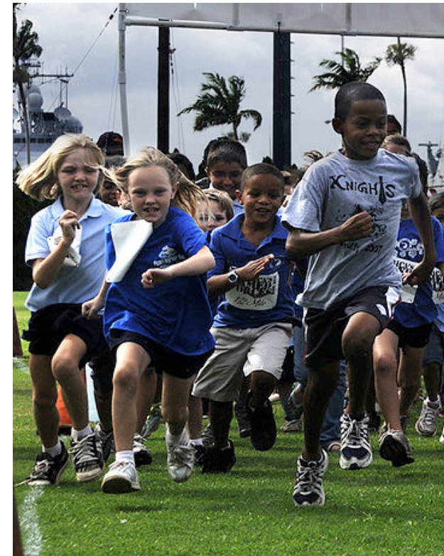
Photo: Children running a race in Pearl Harbor, HI. May, 2010

However, the purpose of PE is not just to provide exercise so students don't get overweight. Scientists have shown that regular exercise can help improve student's attention span, memory, and learning. In California, kids who were physically fit scored twice as well on tests as kids who were unfit. Exercise by itself won't make you smarter, but it gets you ready to learn.